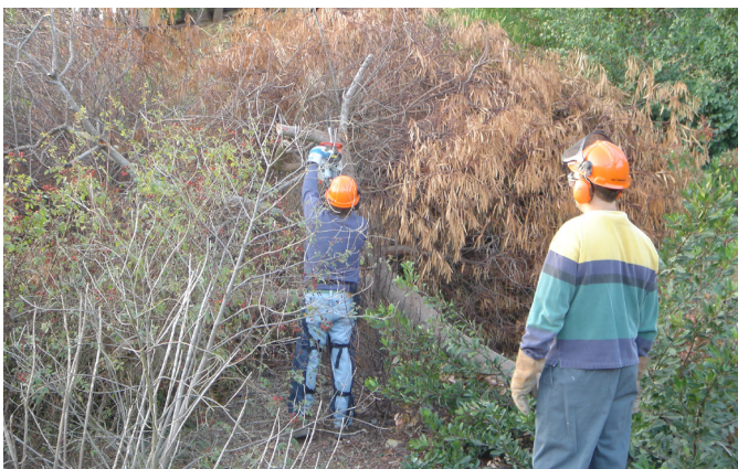
Increasing brush management awareness especially for resident's residing adjacent to North Park hillsides and canyons assists in brush fire prevention.