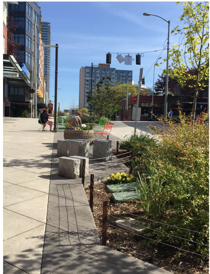
Bio-filtration techniques can work together with storm drain infrastructure to treat storm water and reduce storm water pollution.

A Property and Business Improvement District (PBID) is a tool available to property and business owners to improve a commercial area and is a special benefit assessment district designed to raise funds within a specific geographic area. Funds may be raised through a special assessment on real property, businesses, or a combination of both, and are used to provide supplemental services beyond those provided by the city. See Figure 5-1 of the Economic Prosperity Element for the boundaries of the Business Improvement and Maintenance Assessment Districts.