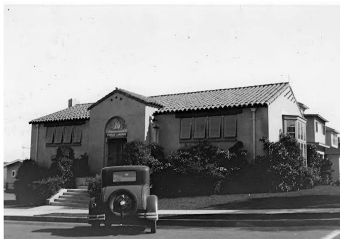
University Heights Branch Library in 1926.

The existing North Park Branch Library, originally built in 1959, is 8,000 square-foot and is located at 3795 31st St. There are plans to build a new approximately 25,000 square feet new library depending on the site selected. The University Heights library located on Park Boulevard at Howard Avenue also services the North Park Community. However the long-time vision shared by the North Park Planning Committee and the Uptown Planners is for the University Heights Library to move into the historically designated Teacher's Annex in the Uptown Planning area. General Plan policies PF-J.3 and PF-J.5 which support larger service areas for library facilities.