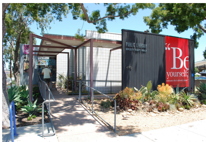
The University Heights Library in 2015.