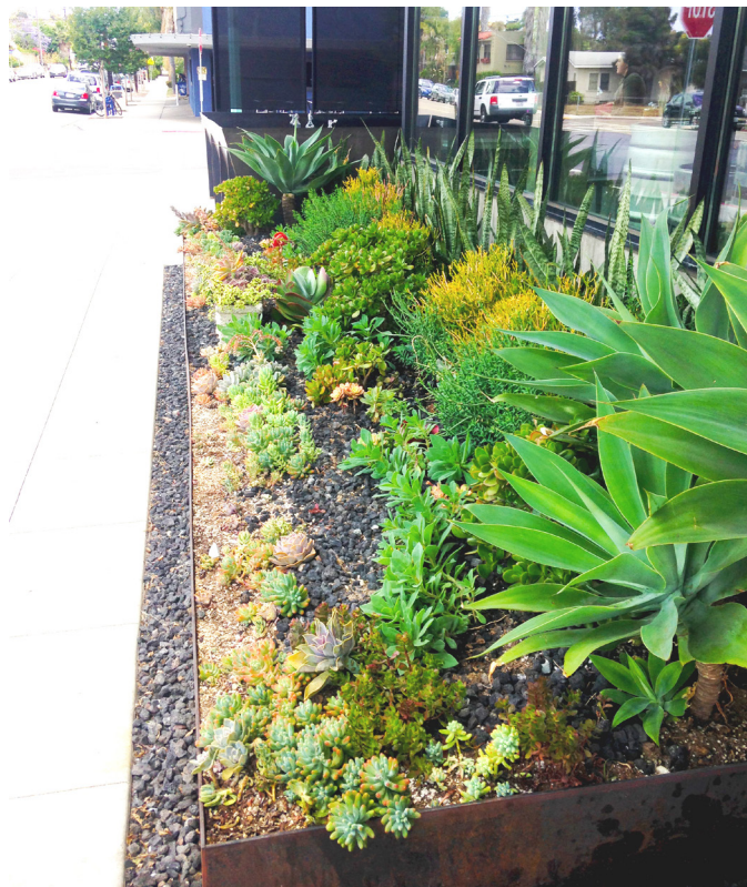
Use of "purple pipe" or reclaimed water is ideal for irrigation along sidewalks, streets, medians, and other right-of-way.