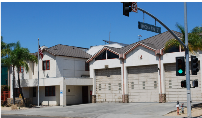
Fire Station 14 located at 32nd Street and Lincoln Avenue provides fire and life safety service to the North Park community.