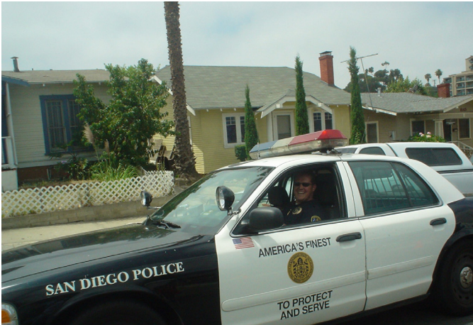
The North Park community is served by the Mid-City Neighborhood Division of the Police Department.