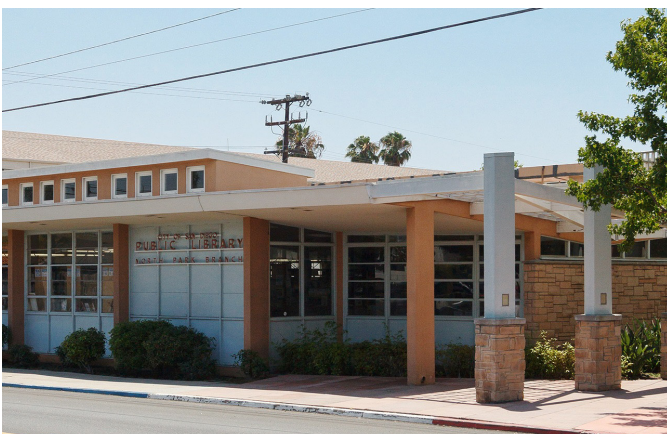
The North Park Library located 31st Street and North Park Way is one of two libraries serving residents within the North Park community.