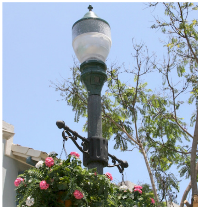
Historic "acorn" style street lighting not only improves safety for pedestrians, vehicles, and properties at night; it is also an integral component of North Park's historic character.