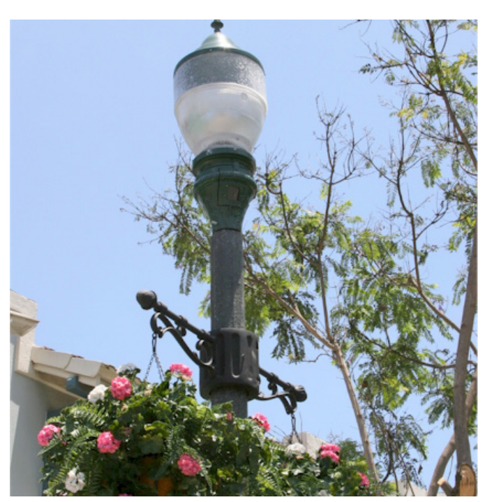
Historic "acorn" style street lighting not only improves safety for pedestrians, vehicles, and properties at night; it is also an integral component of North Park's historic character.