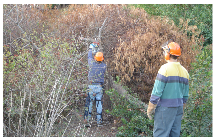
Increasing brush management awareness especially for resident's residing adjacent to North Park hillsides and canyons assists in brush fire prevention.

PF-1.14 Support the implementation of high speed internet technologies, including fiber optics.