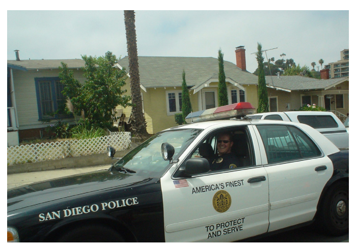
The North Park community is served by the Mid-City Neighborhood Division of the Police Department.