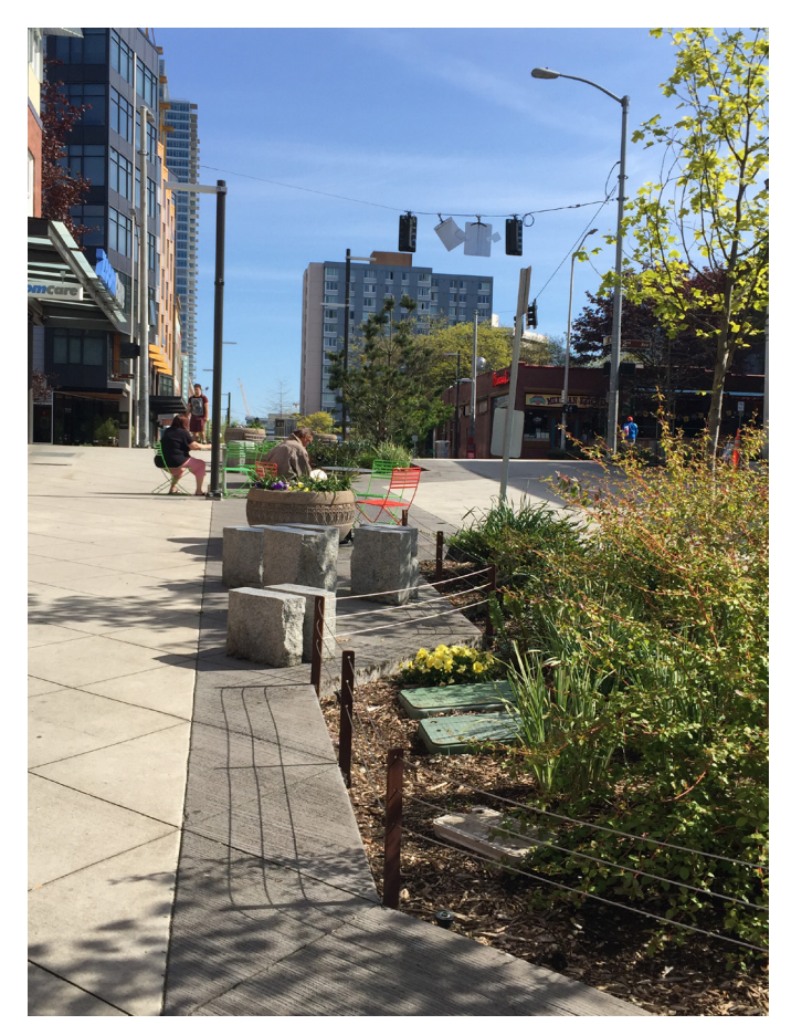
Bio-filtration techniques can work together with storm drain infrastructure to treat storm water and reduce storm water pollution.

A Property and Business Improvement District (PBID) is a tool available to property and business owners to improve a commercial area and is a special benefit assessment district designed to raise funds within a specific geographic area. Funds may be raised through a special assessment on real property, businesses, or a combination of both, and are used to provide supplemental services beyond those provided by the city. See Figure 5-1 of the Economic Prosperity Element for the boundaries of the Business Improvement and Maintenance Assessment Districts.