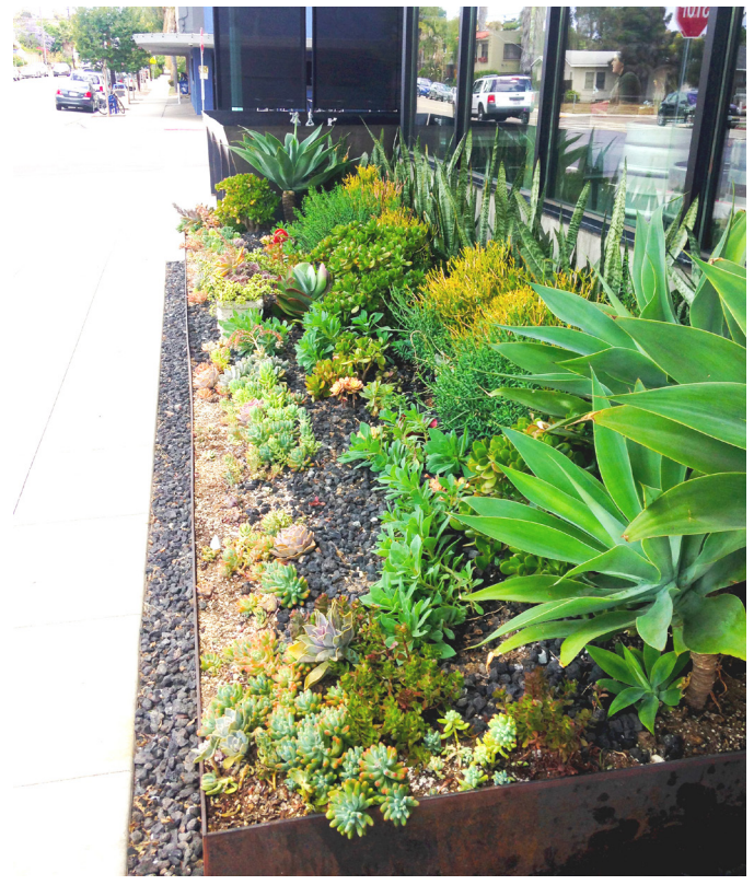
Use of "purple pipe" or reclaimed water is ideal for irrigation along sidewalks, streets, medians, and other right-of-way.