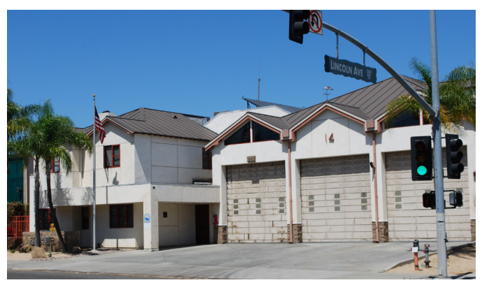
Fire Station 14 located at 32nd Street and Lincoln Avenue provides fire and life safety service to the North Park community.