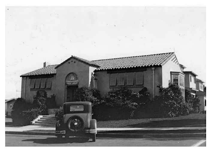
University Heights Branch Library in 1926.

The existing North Park Branch Library, originally built in 1959, is 8,000 square-foot and is located at 3795 31st St. There are plans to build a new approximately 25,000 square foot new library depending on the site selected. The University Heights library located on Park Boulevard at Howard Avenue also services the North Park Community. However the long-time vision shared by the North Park Planning Committee and the Uptown Planners is for the University Heights Library to move into the historically designated Teacher's Annex in the Uptown Planning area. General Plan policies PF-J.3 and PF-J.5 which support larger service areas for library facilities