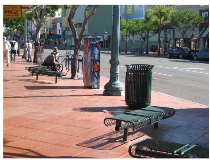
Maintenance Assessment Districts (MAD's) and Business Improvement Districts (BID's) are fund enhancements that are beneficial to pedestrian, consumers, and businesses alike.