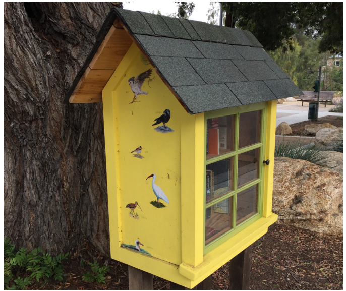
Neighborhood lending libraries such as this one on Lewis Street serve to supplement library resources and build a sense of community.

One of the most important public services is the provision of schools and the offering of quality education to the residents of the community. Schools that serve Uptown are centrally located and within walking distance to public transit. Uptown is served by five public schools: Florence, Alice Birney, and Grant Elementary Schools, Roosevelt Middle School, and San Diego High School. In addition, there are a number of charter