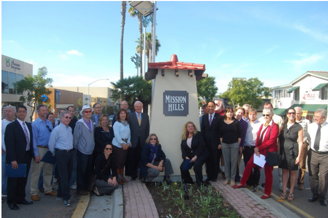
The Mission Hills BID consists of over 500 business license holders located along West Lewis Street, Fort Stockton Drive, and Goldfinch Street; the West Washington Street and University Avenue corridors; and Reynard Way and India Street's International Restaurant Row.

The community's water, wastewater, and storm water infrastructure has issues with aging, insufficient capacity, and outmoded design. The City is addressing these issues for the water and sewer systems through rate increases beginning in 2007 to replace and improve infrastructure.