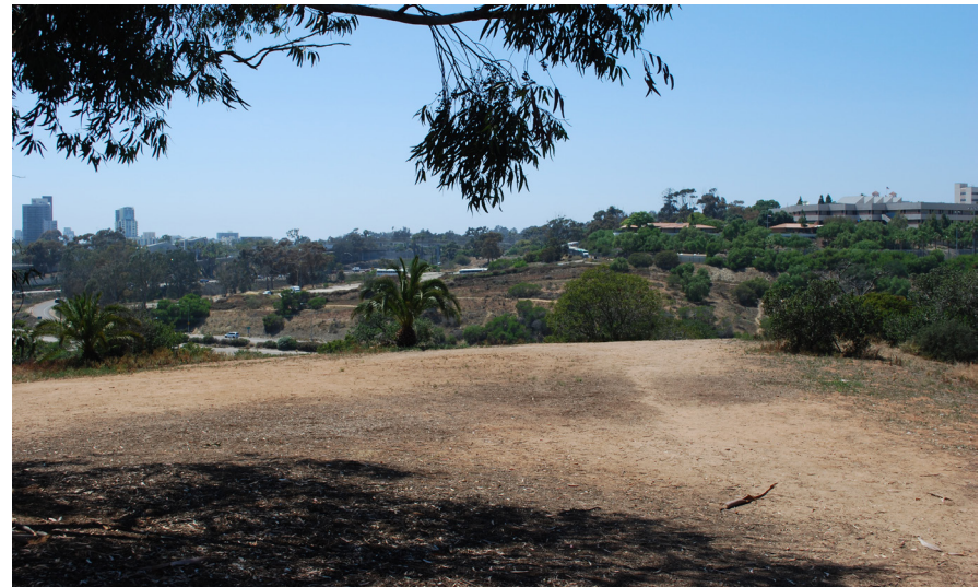
An underused portion of Balboa Park adjacent to Golden Hill is identified as a park equivalency for a future pocket park with prominent views.