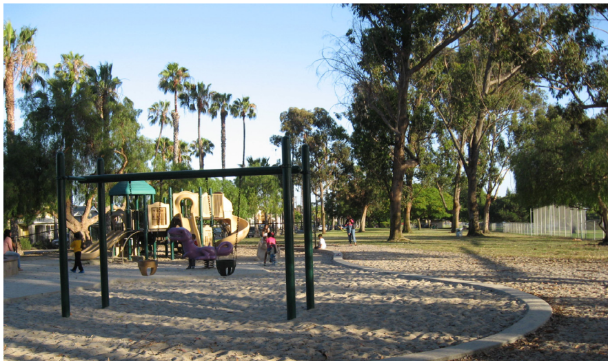
28th Street Park will be expanded to include additional park amenities such as picnic tables, an exercise course, or seating areas.