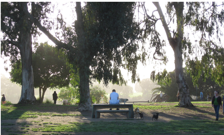
It is recommended to improve Grape Street Park, within Balboa Park, by constructing new park amenities such as a children's play area or picnic areas, or by upgrading the dog off-leash area.