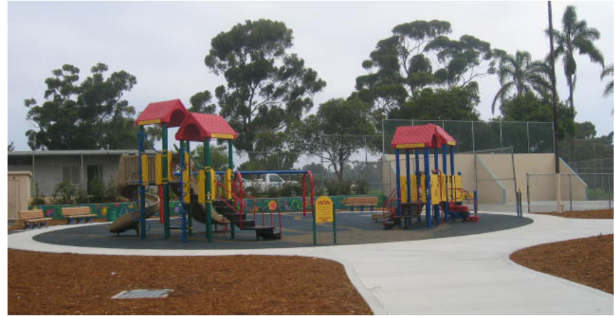
A children's play area is one of the park amenities within Golden Hill Community Park.

Aquatic Complex: Serves population of 50,000. Future population of 24,010 people divided by 50,000 people = 0.48 Aquatic Complex.