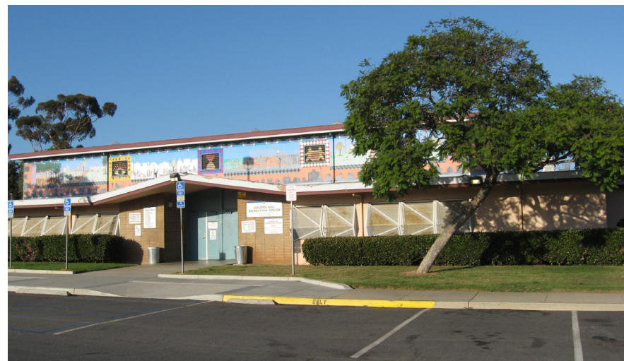
Golden Hill Recreation Center is to be expanded to provide additional multi-purpose rooms or other community-serving facilities.