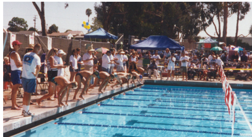
Bud Kearns Aquatic Complex, within Balboa Park, is to be expanded to serve both Golden Hill and North Park.

Figure 7-1 depicts the approximate locations of existing and proposed open space, parks, recreation facilities and park equivalencies. Note: Identification of private property as a potential park site does not preclude permitted development per the designated land use or underlying zone. The City will continue to work with community members to seek future opportunities for provision of parks and recreation facilities. In addition to the inclusion of these projects in the Golden Hill Impact Fees Study, identification of potential donations, grants and other funding sources for project implementation will be an ongoing effort.