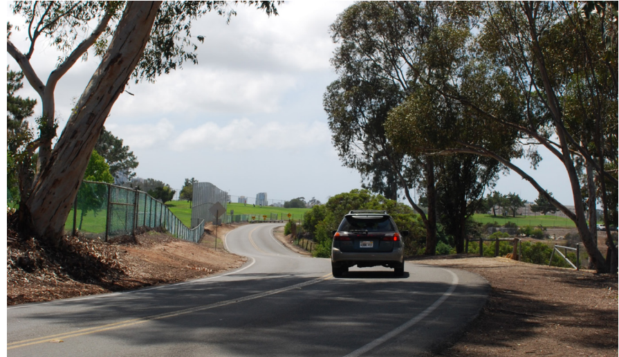
A pedestrian pathway along Golf Course Drive, viewed here from 28th Street, is planned to connect the Golden Hill Recreation Center to 28th Street.

All new and existing parks and recreation facilities are required to meet ADA guidelines when they are constructed or retrofitted for improvements or upgrades. This could include adding accessible pedestrian ramps, providing paved pathways at acceptable gradients that lead from a public street, sidewalk or parking area to a park destination (referred to as the