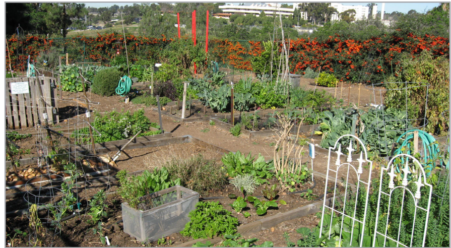
The Golden Hill Community Garden located on Russ Boulevard, within Balboa Park, is to be expanded to incorporate amenities such as a stage/gathering area, picnic facilities, potting shed, security lighting and public art.