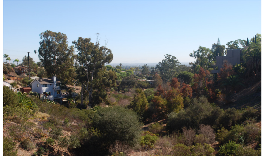
32nd Street Canyon Open Space Trail, viewed here from Cedar Street, will be enhanced with proposed trail amenities including trail kiosk signs, trash containers, and benches where appropriate.