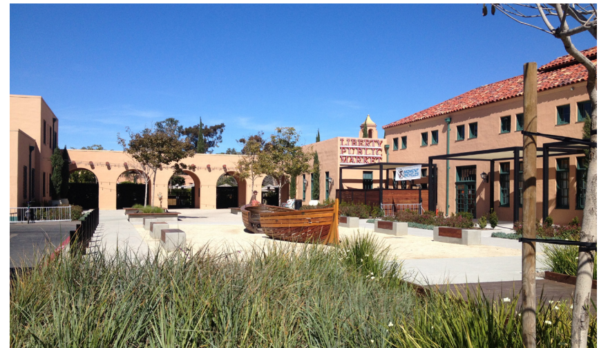
Public plazas and mini parks will help meet recreational needs, complement active commercial uses, and foster pedestrian-oriented activity centers.