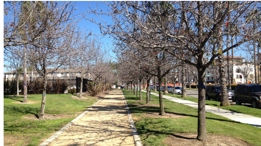
A system of parks and recreational facilities, including linear parks along key corridors, will meet the community's park needs and enhance its livability.