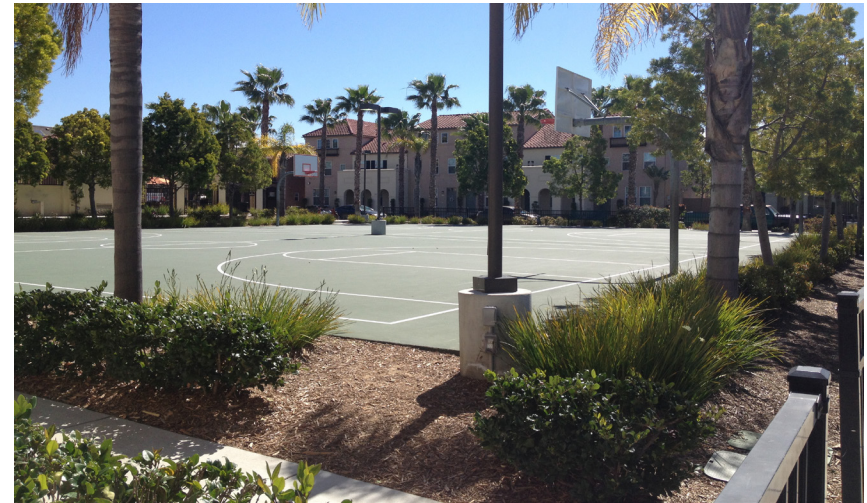
New parks can be designed to incorporate active and/or passive recreation areas, and will serve as neighborhood focal points.