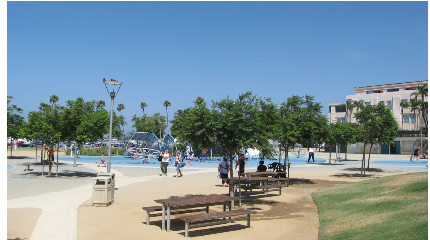
A mix of recreational facilities including neighborhood parks, mini parks, pocket parks, and special activity parks will serve the population of Midway - Pacific Highway.

The Urban Design Element provides policies that guide new development near parks to incorporate active ground floors and outdoor uses adjacent to the proposed parks and plazas. Active ground floors and outdoor uses provide natural surveillance of the parks and plazas which can enhance safety. Pedestrian activity will attract more users to the recreational facilities and to the uses that surround it that can result in economic benefits to businesses. Parks may also incorporate storm water retention and/or infiltration infrastructure. See the Conservation Element for storm water management policies.