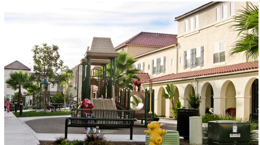
Parks may be constructed through future public and private development projects. This park is integrated into a residential area and benefits from natural surveillance from the residences facing the park.