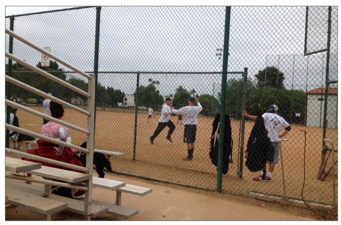
The Presidio Community Park provides residents with opportunities for active recreation.

The resource-based Presidio Park, the Old Town State Historic Park and the County of San Diego's Heritage Park are addressed in multiple elements of the Community Plan. These parks constitute large components of the land use fabric and are addressed as part of the sub-districts in the Land Use Element. The historic and cultural resources within the parks are addressed in the Historic Preservation Element, and the heritage tourism aspects of the parks are addressed in the Economic Prosperity Element.