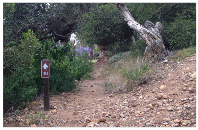
Improvements to existing trails within Presidio Park will enhance the user experience and increase opportunities for the interpretation of the natural and cultural resources of this park.

An aquatic complex to be located at the NTC Park at Liberty Station will meet a portion of the community's aquatic recreation needs, and a second aquatic complex will meet the remainder. The Aquatic Complexes will provide a 25 to 50 meter pool and supporting facilities that include a pool building with a reception area, restrooms, showers, meeting rooms, lockers and storage.