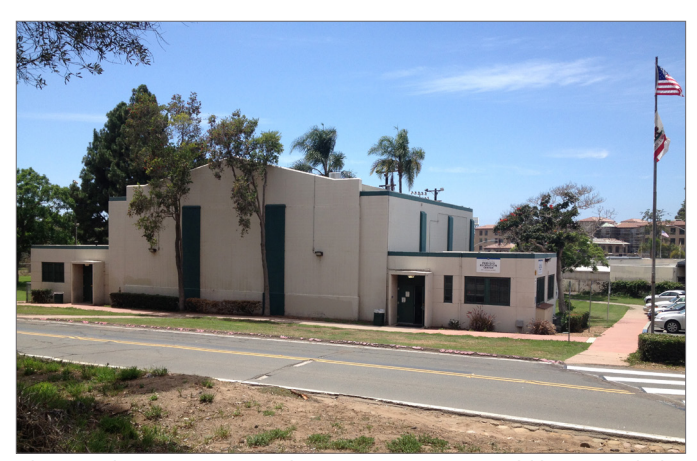
The Presidio Community Park Recreation Center could be expanded to allow additional activities.