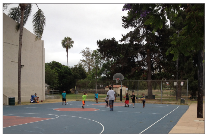
The Presidio Recreation Center offers residents space to play sports as well as organized lessons and activities.