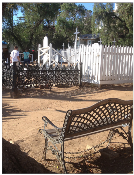
Enhancements to El Campo Santo Cemetery to improve access and support visitors could include benches, interpretive signage, and accessible entrance ramps.