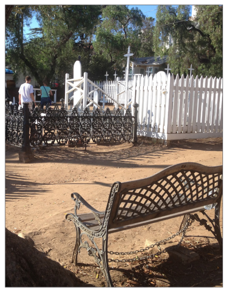
The enhancement of El Campo Santo Park with benches, interpretive signage, and accessibility modifications would improve the neighborhood pocket park.