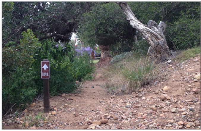
Improvements to existing trails within Presidio Park will enhance the user experience and increase opportunities for the interpretation of the natural and cultural resources of this park.

An aquatic complex to be located at the NTC Park at Liberty Station will meet a portion of the community's aquatic recreation needs, and a second aquatic complex will meet the remainder. The Aquatic Complexes will provide a 25 to 50 meter pool and supporting facilities that include a pool building with a reception area, restrooms, showers, meeting rooms, lockers and storage.