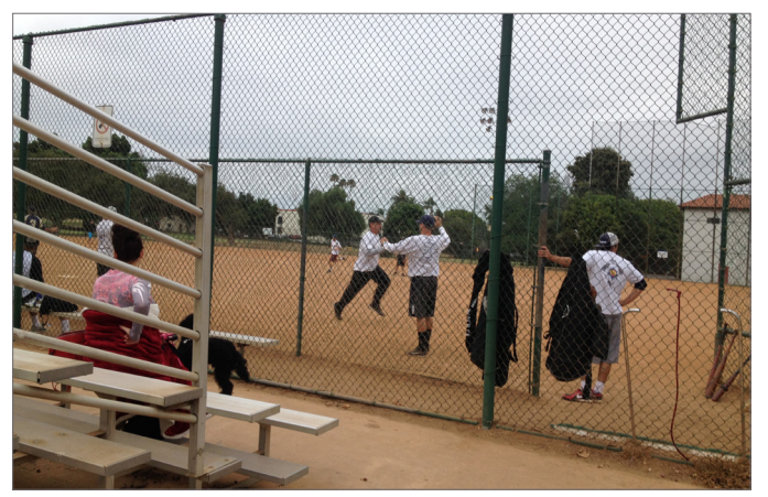
The Presidio Community Park provides residents with opportunities for active recreation.

The resource-based Presidio Park, the Old Town State Historic Park and the County of San Diego's Heritage Park are addressed in multiple elements of the Community Plan. These parks constitute large components of the land use fabric and are addressed as part of the sub-districts in the Land Use Element. The historic and cultural resources within the parks are addressed in the Historic Preservation Element, and the heritage tourism aspects of the parks are addressed in the Economic Prosperity Element.