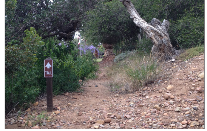
Improvements to existing trails within Presidio Park will enhance the user experience and increase opportunities for the interpretation of the natural and cultural resources of this park.

An aquatic complex to be located at the NTC Park at Liberty Station will meet a portion of the community's aquatic recreation needs, and a second aquatic complex will meet the remainder. The Aquatic Complexes will provide a 25 to 50 meter pool and supporting facilities that include a pool building with a reception area, restrooms, showers, meeting rooms, lockers and storage.