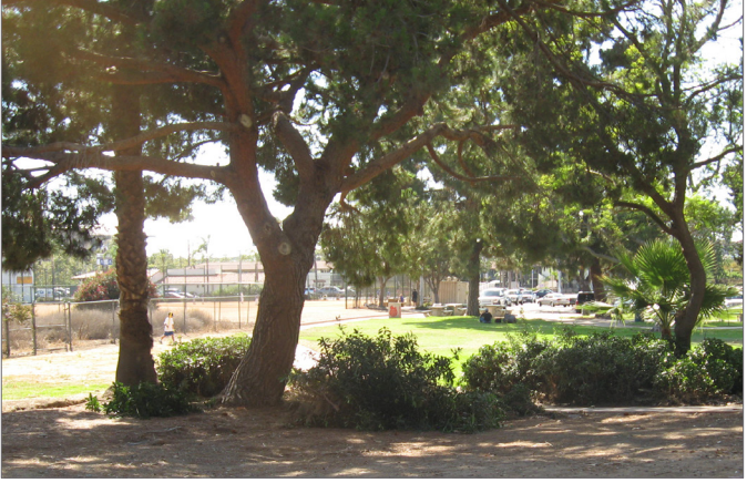
The Presidio Community Park, a population-based park, provides picnic areas and passive recreation amenities for residents.

Population-based parks and recreation facilities are located within close proximity to residents and intended to serve the daily needs of the community, see Figure 8-1. Population-based parks in Old Town consist of the Presidio Community Park and the El Campo Santo Cemetery, summarized in Table 9-1. These populationbased parks will continue to serve Old Town San Diego's residential population park and recreational needs. The Community Plan envisions enhancing the recreational experience and accessibility of the parks and recreational facilities within Old Town San Diego and identifies potential improvements. The community will provide guidance on the type, location, and design of any specific improvements.