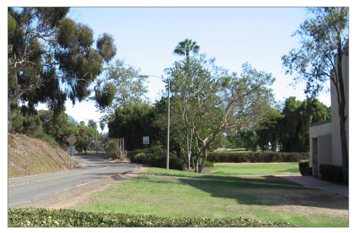
Installation of a sidewalk along Jackson Drive and improvements to Presidio Community Park will increase recreation opportunities for Old Town residents.

Improvements to the Presidio Community Park could include a new outdoor children's play area, enhancements to the picnic area, the installation of pedestrian-oriented lighting and native landscaping, and the replacement of chain link fencing with fencing consistent with the community's historical character where appropriate. A public sidewalk along Jackson Drive connecting to Mason Street and sidewalk along Taylor Street toward Mission Valley to improve park access for residents are addressed in the Mobility Element.