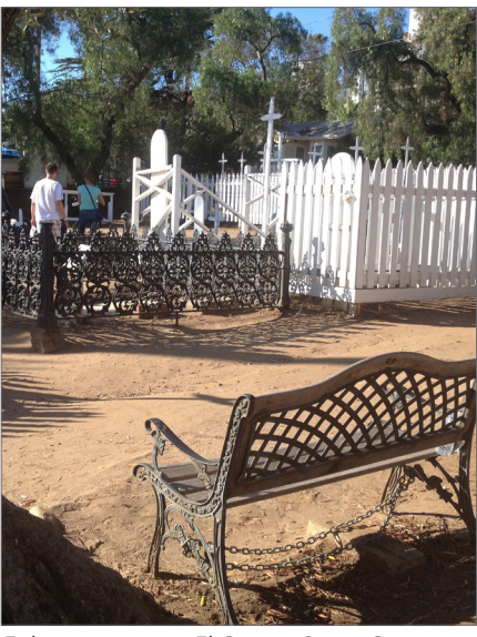
Enhancements to El Campo Santo Cemetery to improve access and support visitors could include benches, interpretive signage, and accessible entrance ramps.