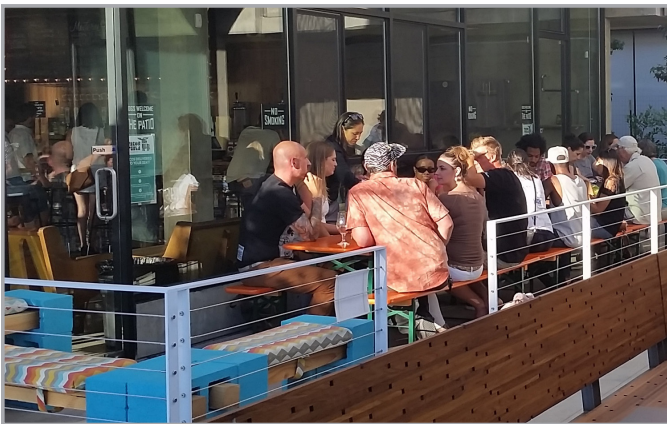
The increasing trend for eating and drinking establishments to incorporate “open air” concepts and outdoor patios has been a result of North Parks’ favorable climate and unique street activity.