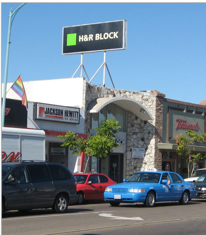
With the many streets that cross the community, roadway noise generated by motor vehicles is the primary source of noise within the community.

The General Plan identifies motor vehicle noise as a major contributor of noise within the City emanating from arterial roads, interstate freeways, and state highways. Higher levels of motor vehicle noise are generated primarily from the community's commercial corridors of University Avenue and El Cajon Boulevard, as well as Interstate-805. The General Plan allows residential uses along mixed-use corridors up to the 75 dB noise level, if sound attenuation measures are included to reduce the interior noise levels to 45 dB. Collector streets, such as 30th Street, Adams Avenue, and Upas Street, which provide traffic connections between commercial areas and single family neighborhoods located at the northern and southern ends of the community, have also raised a growing concern and need for attenuating motor vehicle traffic noise. The use of traffic calming measures to slow down traffic, increase pedestrian safety, and livability has been widely accepted in the community's residential neighborhoods. Reducing vehicular speeds for safety reasons also has the added benefit of reducing roadway noise associated with motor vehicles.