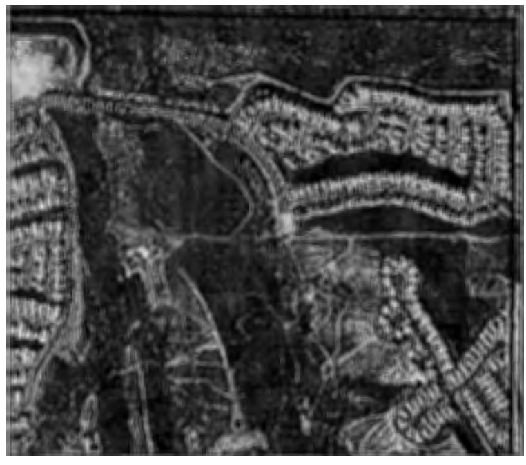
CONTACT: TRANSPORTATION & STORM WATER