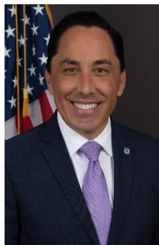
TODD GLORIA Mayor City of San Diego

A handwritten signature in blue ink that reads "Todd Gloria".