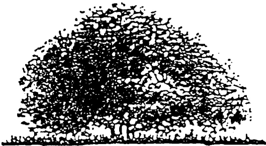
Chaparral Plant Before Pruning

Remaining plants, 4 feet or more in height, should then be cut and shaped into "umbrellas." This means pruning one half of the lower branches to create umbrella-shaped canopies. This allows you to see and deal with what is growing underneath. Upper branches may then be shortened to reduce fuel load as long as the canopy is left intact. This keeps the plant healthy and the shade from the plant canopy reduces weed and plant growth underneath. Vegetation that is less than 4 feet in height, like coastal sage scrub, should be cut back to within 12 inches of the root crown.