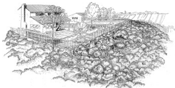
Before Brush Management

Step 2: Thin.... the entire Zone 2 area. Start by cutting down 50% of the plants over 2 feet in height to a height of 6 inches. Don't go any lower than 6 inches so the roots remain to control soil erosion. The goal is to create a "mosaic" or more natural look, as shown below, so do your cutting in a "staggered" pattern. Leave uncut plant groupings up to 400 square feet — that's a 20x20-foot area, or an area that can be encircled by an 80-foot rope — separated by groupings of plants cut down to 6 inches. Thinning should be prioritized as follows: 1) invasive non-native species; 2) non-native species; 3) flammable native species; 4) native species; and 5) regionally sensitive species.