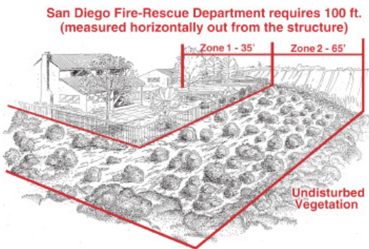
After Thinning and Pruning

Step 3: Prune.... all plants or plant groupings that are left after the thinning process to achieve the horizontal and vertical clearances shown in the illustration below. (For trees in Eucalyptus Woodlands areas, see FPB Policy B-08-1.)