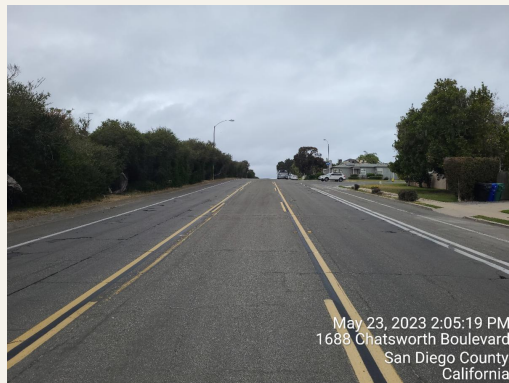
Photos: New slurry seal in Point Loma.