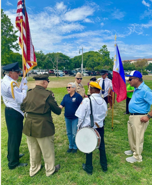
Photos: At the Filipino American Friendship Festival.

The 3 rd Annual Filipino American Friendship Festival was held at Liberty Station in District 2 on Saturday, July 22, 2023. The yearly festival offers food, music, and fun activities for the entire family. Filipino culture, heritage, and history was celebrated at the event. My office was happy to support and attend the festival.