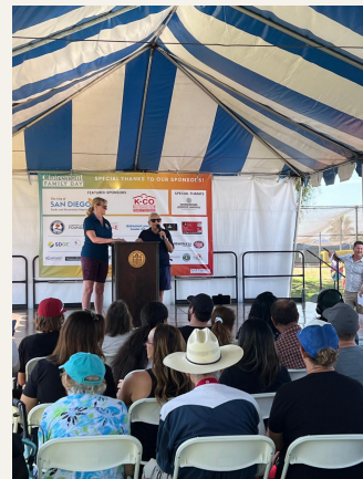
Photos: At the Clairemont Family Family Day.