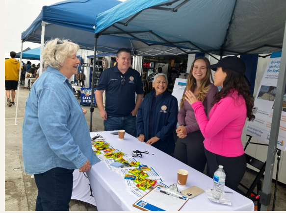
Photos: At the OB Pier Pancake Breakfast.

The 25th Annual OB Pancake Breakfast was a fabulous event, especially when proceeds from the event went to fund the OB Food and Toy Drive. This supports about 100 families and seniors in need during the holiday season.