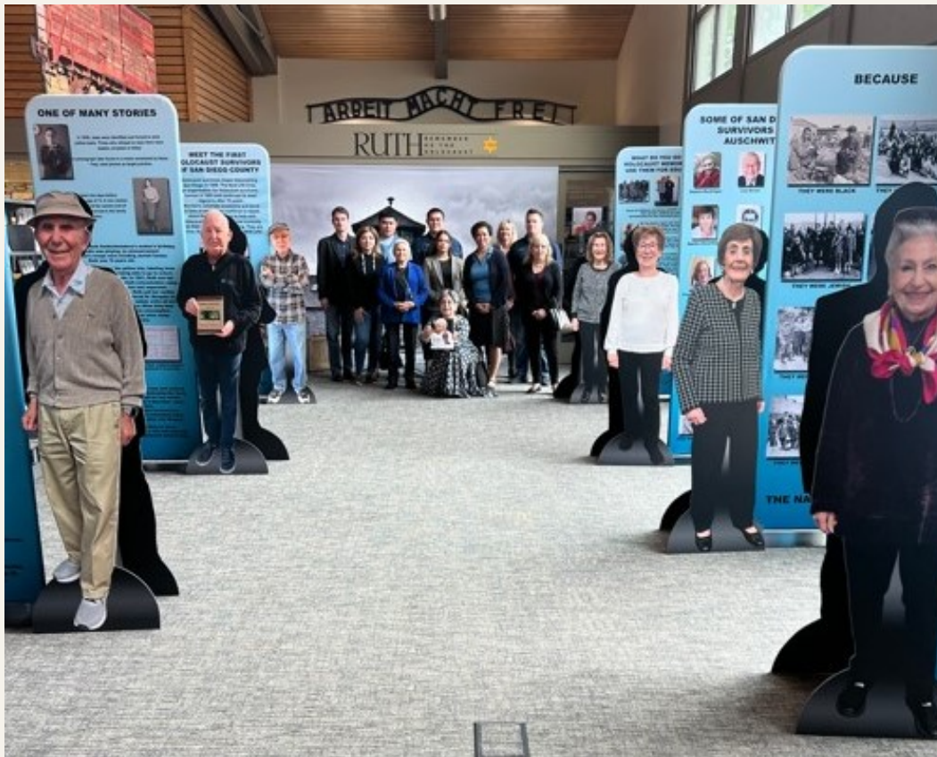
Photo: A tour of the Holocaust exhibit at the Rancho San Diego Library.