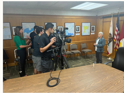
Photos: The SVO Amendments presentation at the Committee meeting and speaking with the media.