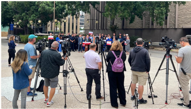
Photos: The SB43 Rally at City Hall.