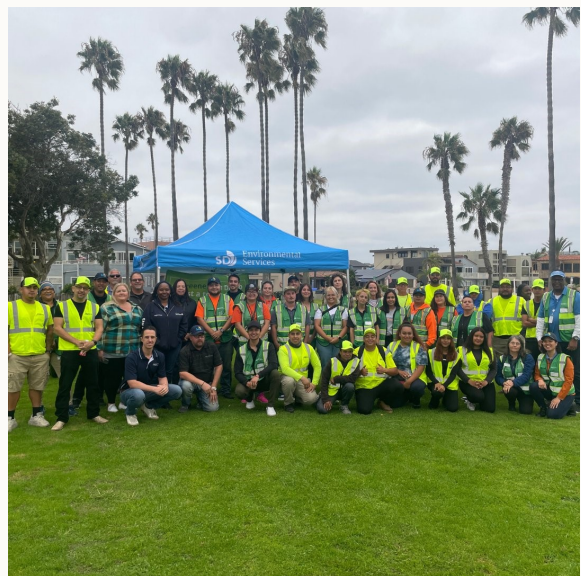
Photos: The City of San Diego's Environmental Services Department (ESD) staff in Mission Beach.