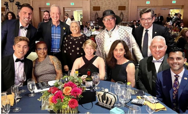
Photo: Celebrating the 50th Anniversary of the San Diego LGBTQ+ Center.

This year marks the 50th Anniversary of the San Diego LGBTQ+ Center. I am so proud of the work the Center has done and will continue to do in our communities. The Center is a vital resource in the region, and its programs and services continue to make such a positive impact on our LGBTQ+ community.