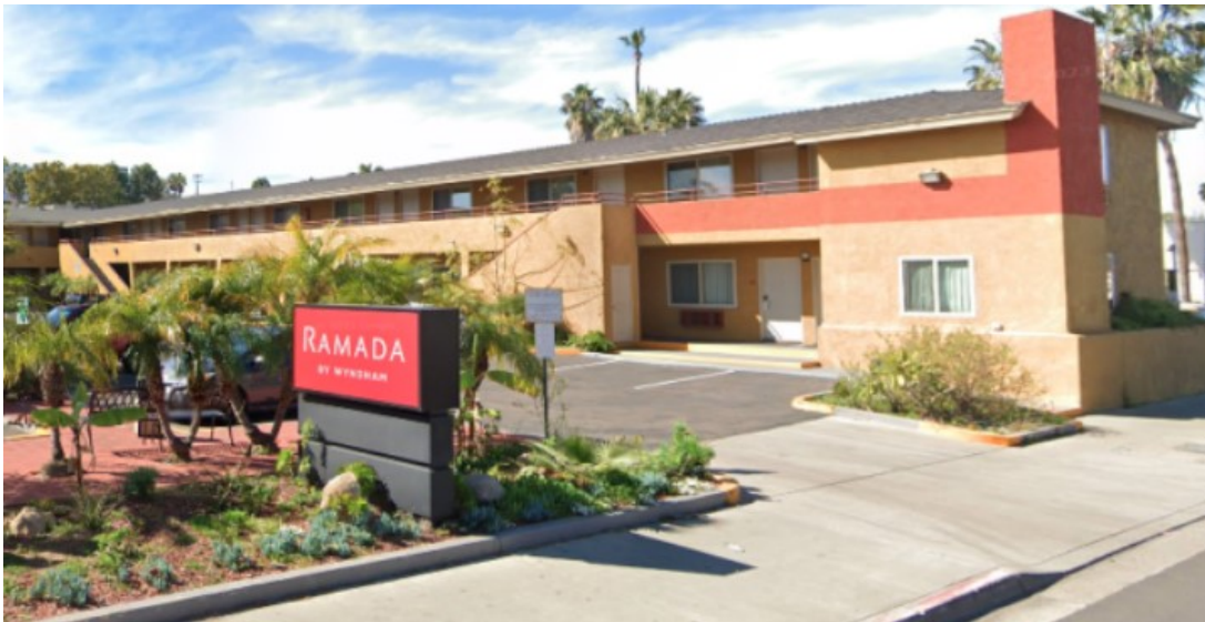
Photo: The Ramada Inn in the Midway District.

Last week, the state granted San Diego $20.75 million in Homekey funding, a significant investment that will create 75 affordable rental units with supportive services for homeless individuals. We know that housing ends homelessness, and our commitment to providing affordable housing is a real solution. The funding will rehabilitate two properties in the Midway District and Ocean Beach in District 2. The