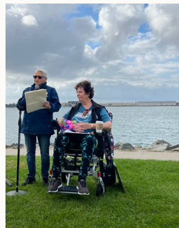
Photos: At the FSHD Society's "Walk 'n' Roll to Cure" event at Harbor Island Park.