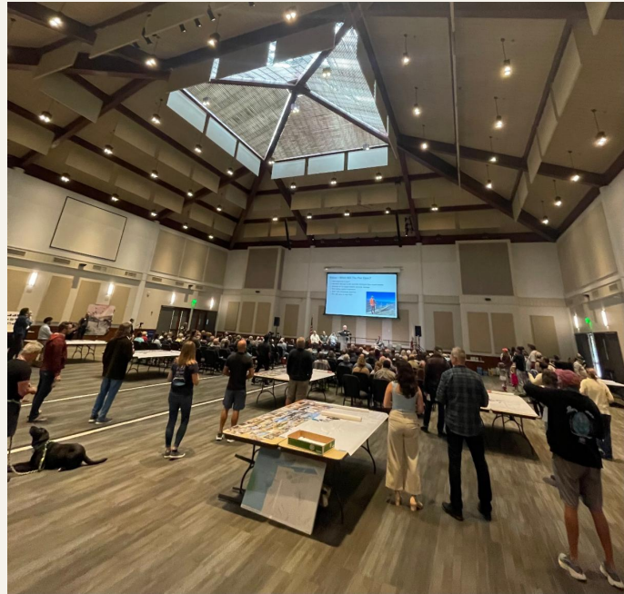
Photo: The second OB Pier Renewal Project Public Workshop.

For more information on the OB Pier Renewal Project, follow the link: OB Pier Renewal Project