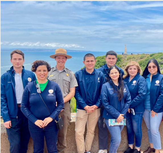
My staff visiting the Cabrillo National Monument in Point Loma.

My staff recently visited the Cabrillo National Monument in Point Loma, which is in District 2. The park is a beautiful spot along the coast, where visitors can enjoy the outdoors and learn about San Diego's early history. The Cabrillo National Monument Foundation provides community projects, programs, and summer camps. For more information, visit their website: Cabrillo National Monument