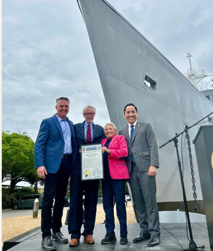
Photo: At the Liberty Station Centennial Celebration.

Here's a link if you want to learn more: Liberty Station Centennial Celebration