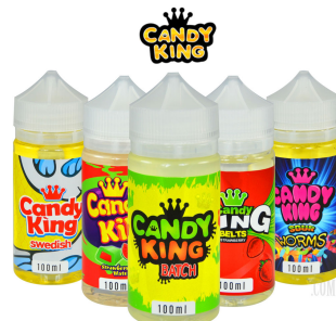
Candy Tobacco Products marketed to children by the Tobacco Industry.