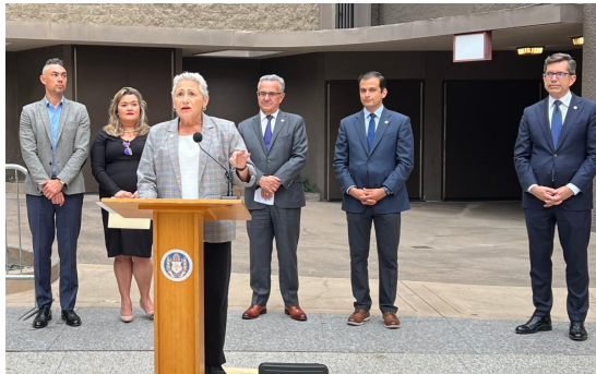
City Council Budget Press Conference at the Civic Center Plaza.