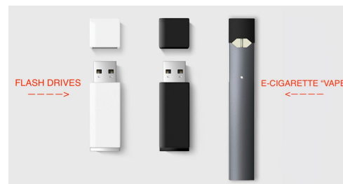
Flavored E-Cigarettes that look like thumb-drives that students use for school work.