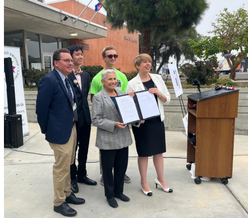
SAAFE Act Press Conference with San Diego Unified District.