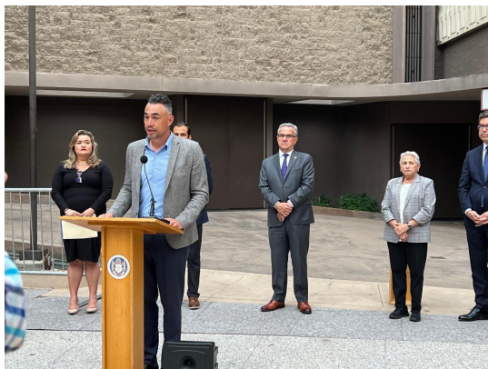
Council President Sean Elo-Rivera (District 9) speaking at Budget Press Conference at the Civic Center Plaza.