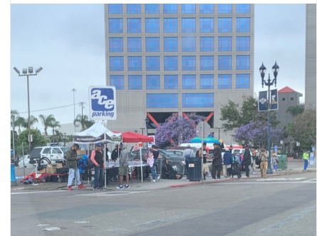
Sidewalk Vendors in Downtown San Diego.