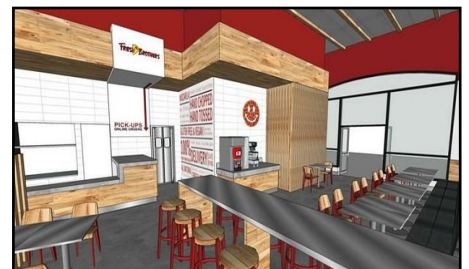
Look for Fresh Brothers Pizza to arrive at the Village in PHR this fall.