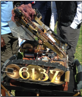
HUGO, the Steampunk style robot created by the UC RoBowties

The UC RoBowties, a "garage" FIRST robotics team based in University City, took 3rd Place in the First Robotics World Championships in 2016.