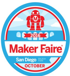
Maker Faire San Diego showcases the amazing work of all types and ages of makers

All San Diegans are invited to showcase their innovative and clever projects at Maker Faire San Diego 2016 .