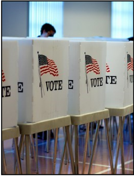
The Rules Committee helped decide what will go on the November ballot.

At the June 20 Rules Committee meeting, the Committee discussed Charter Section 40, relating to the City Attorney's qualifications and duties.