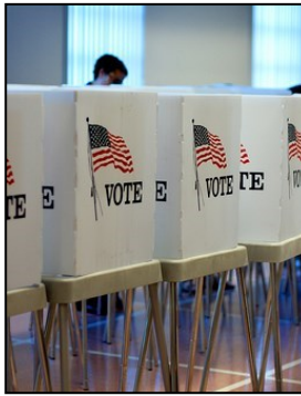
Multiple citywide measures will be on the November Ballot

At the August 3 meeting, the Rules Committee discussed proposed amendments to the City's campaign laws recommended by the Ethics Commission. They also reviewed the Grand Jury's report regarding campaign law enforcement and training in the City and County of San Diego.