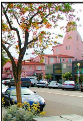
The La Jolla MAD moves forward

After a rigorous process involving community outreach, advertising, and fundraising, the La Jolla Maintenance Assessment District (MAD) was approved by property owners in the Village of La Jolla and ratified by the City Council on November 15.