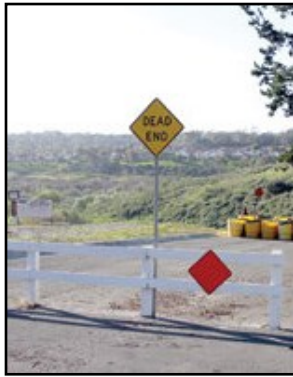
The Regents Road bridge will be removed from the University Community Plan

On Monday, December 5, the City Council voted to amend the University Community Plan.