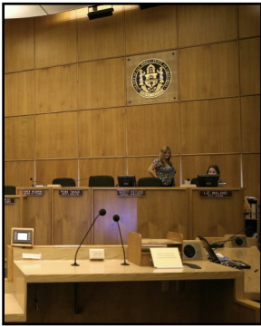
Both the Rules and Charter Review Committee succeeded in passing numerous ballot measures in 2016.