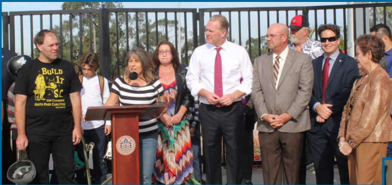
Left: Celebrating the grand opening of the world class Linda Vista Skate Park.