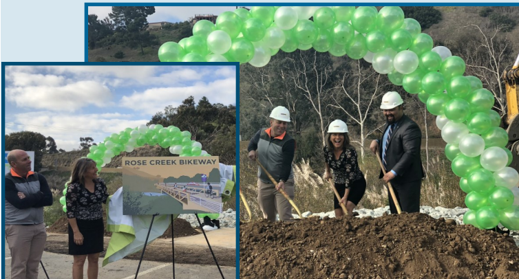
Rose Creek Bikeway ground breaking