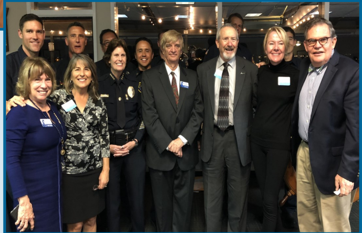
Pacific Beach Town Council Installation Dinner

As the largest Congressionally recognized Coast Guard City, I was proud to join with the Mayor to recognize Coast Guard Sector San Diego Jayhawk Helicopter Crew in honor of their efforts in rescuing victims on January 10, 2018 from their rooftops in Carpinteria, California. Congratulations for a job well done.