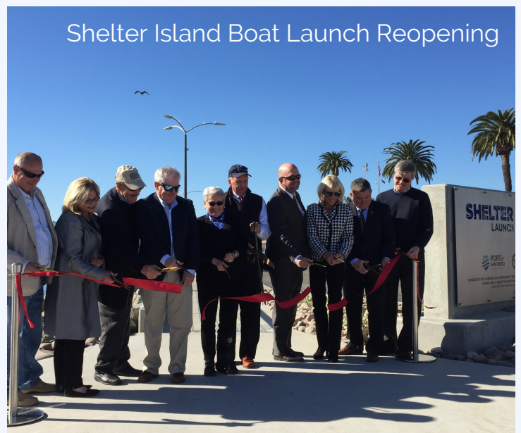
Shelter Island Boat Launch Reopening