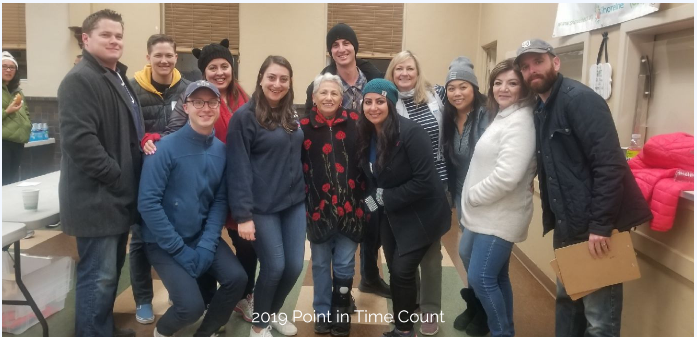
2019 Point in Time Count