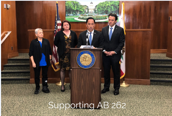
Supporting AB 262