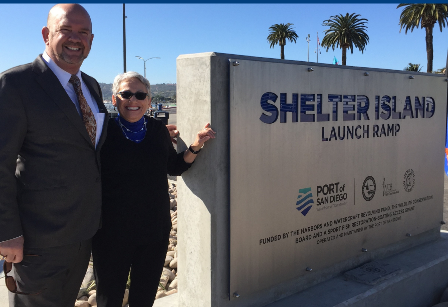
Shelter Island Boat Launch Reopening