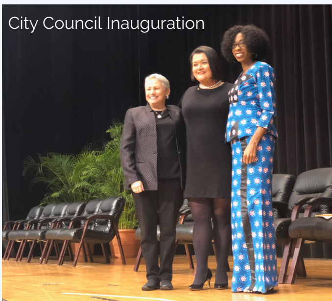
City Council Inauguration