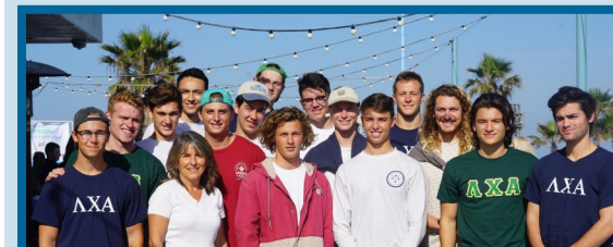
Photo Left: Thank you to the USD Lambda Chi Alpha —Delta Kappa Chapter for volunteering at the event,

olive Café, Olive Bakery, OB Surf Lodge, Wonderland, Broken Yolk and Miss B's Coconut Club.