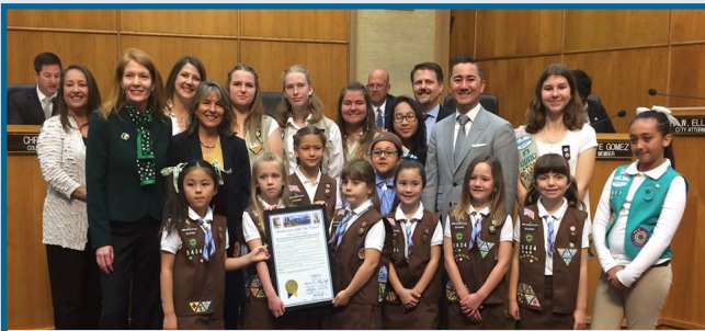
Girls Scouts celebrating their Centennial Anniversary of the Girls Scouts San Diego Council.