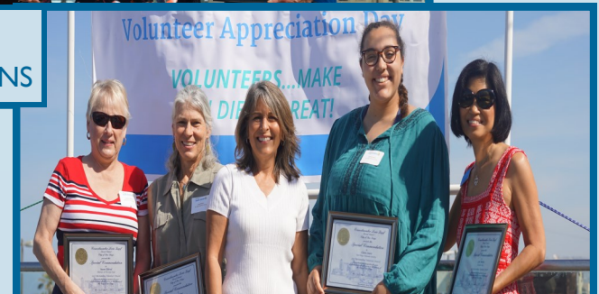
ANIMAL ORGANIZATION VOLUNTEERS