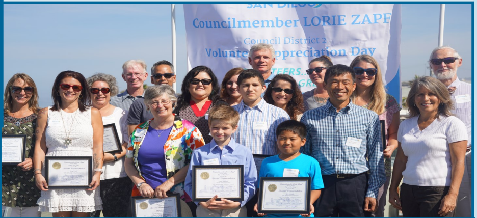
VOLUNTEERS IN EDUCATION

olive Café, Olive Bakery, OB Surf Lodge, Wonderland, Broken Yolk and Miss B's Coconut Club.