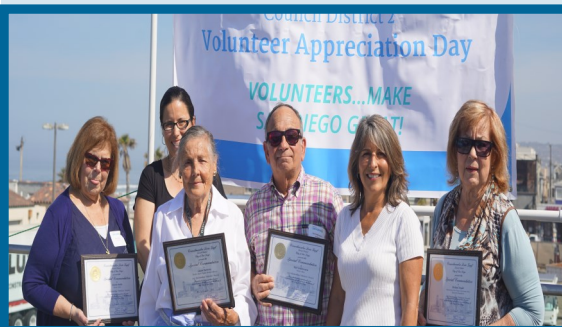
LITERACY AND LIBRARY VOLUNTEERS