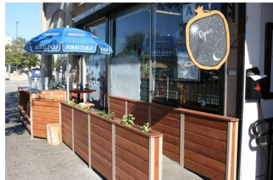
Kafe Sobaka on Broadway in Golden Hill used a grant of $4,173 to create sidewalk seating.

To learn more about the Storefront Improvement Program, visit http://www.sandiego.gov/economic-development/business/starting/improvement.shtml .