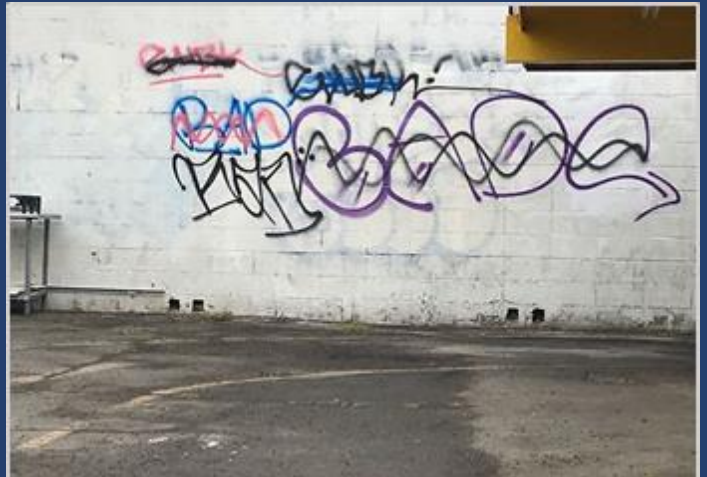
Graffiti Removal in Skyline | Before & After

Thank you to our Oak Park Community organizers and to Teen Challenge International.