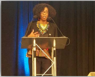
Councilmember sharing remarks at United African American Ministerial Action Council (UAAMAC)