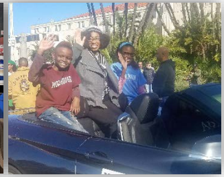
Councilmember was honored to have been the Grand Marshal at the MLK Parade presented by Zeta Sigma Lambda Chapter of the Alpha Phi Alpha