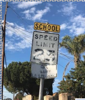
700 block 65th