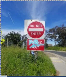
1020 block of Euclid