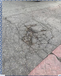
5040 block Market