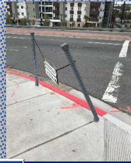
6200 block Imperial