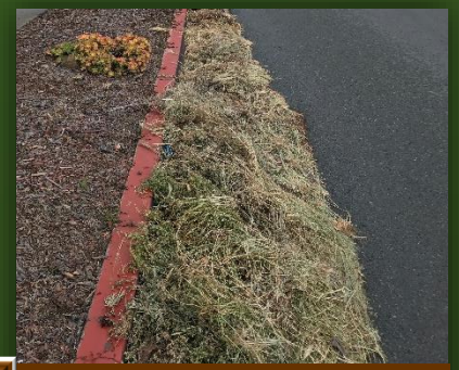
Weed Abatement on Woodman