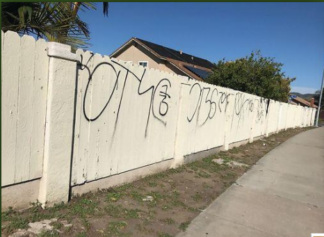
Graffiti removal on Meadowbrook