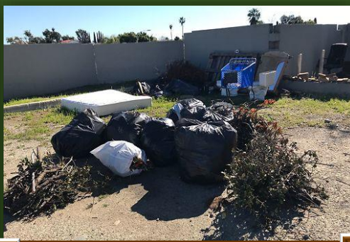
Illegal Dumping on Skyline