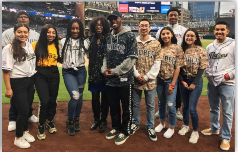
Top photo: April 15 | Honoring the legacy of Jackie Robinson breaking the color barrier in Major League Baseball during Jackie Robinson Day at Petco Park, along with Jackie Robinson YMCA scholars.