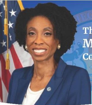
The People's Councilmember Monica Montgomery Steppe Council District 4