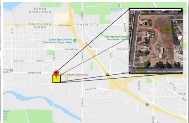
Overview of the upcoming Saturn Boulevard Housing Project

The new development complies with the goals and policies of the General Plan and Otay Mesa-Nestor Community Plan to ensure the project is consistent the neighborhood character.