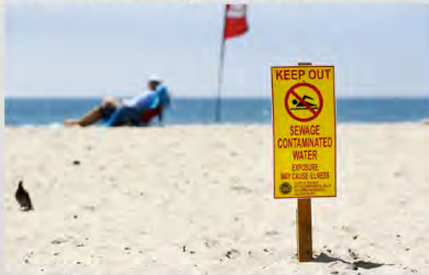
Signs barring swimming at Imperial Beach were up Monday after last week's rains flushed sewage and contaminated soil from the Tijuana River into the ocean. The beaches were declared safe for swimming by the county later in the day.

The sewage flows have routinely closed San Diego County beaches for decades. Last year, Imperial Beach sued the federal government for failing to stop the flows, arguing the government is violating the Clean Water Act. Several other public entities, including the city of San Diego and the state of California filed similar lawsuits.