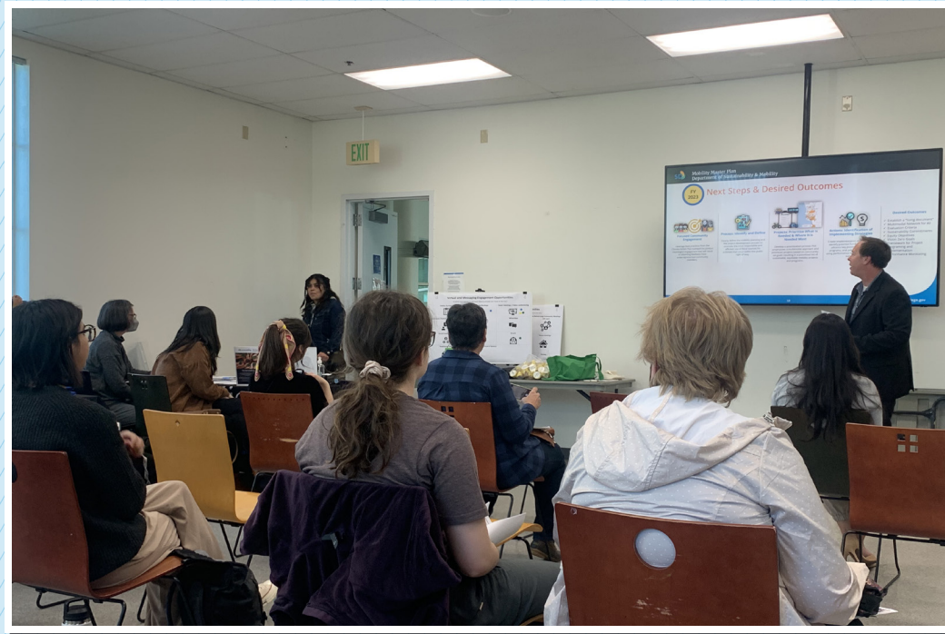
CAP Library Series on mobility