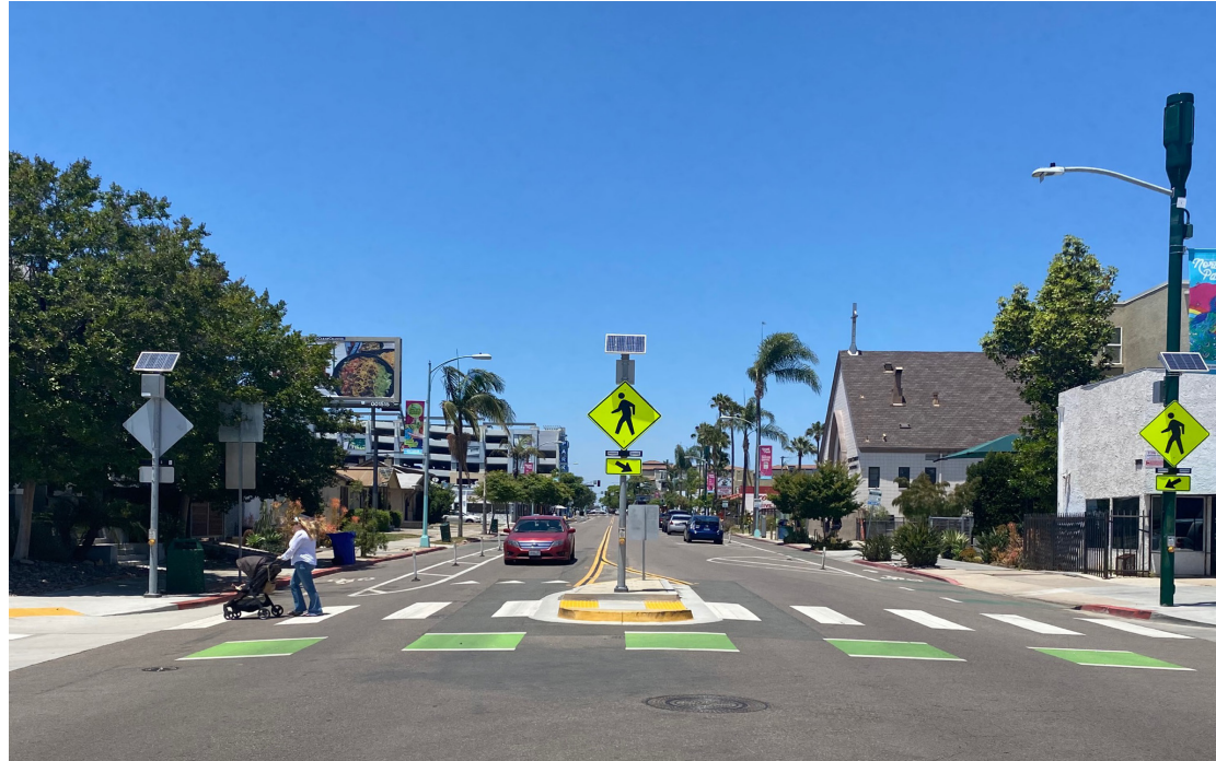
Enhanced pedestrian treatments at 30th Street and Landis Street in North Park

with the greatest need, and thus increasing the number of people that choose to walk, bike, and take transit as their primary mode of transportation whenever possible – because as stated before, every mile and every trip counts. The Mobility Master Plan serves as an implementation-focused roadmap for achieving this safe, accessible, and equitable mobility system.