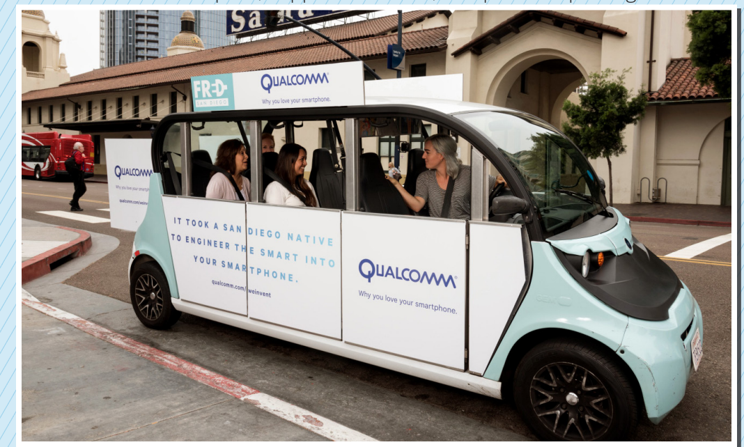
FRED electric shuttle in Downtown San Diego

Objective 9.2 Increase implementation of curb management strategies in commercial, business, and mixed-use areas to efficiently utilize curb space, support deliveries, and promote parking turnover.