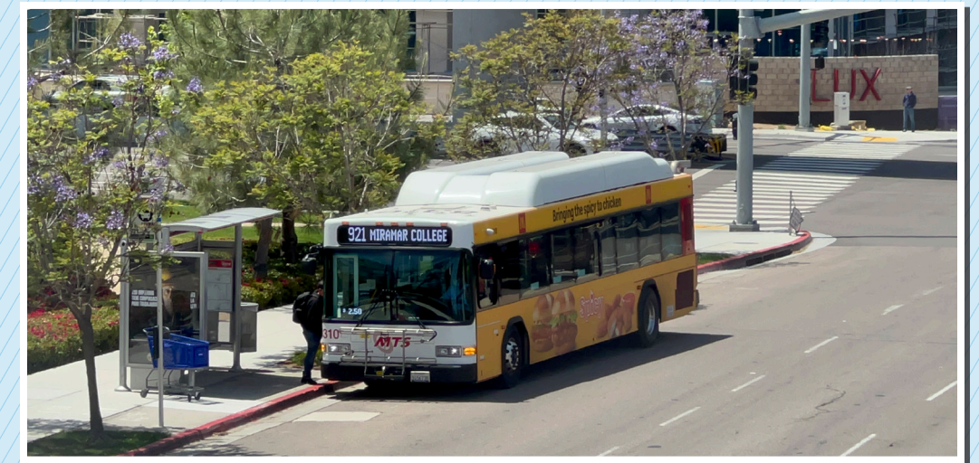
Student boarding a bus along La Jolla Village Drive

Objective 1.5 Work with the San Diego Association of Governments (SANDAG) to continue the Youth Opportunity Pass program and expand it to college students and those community members who have the greatest needs or who could greatly benefit.