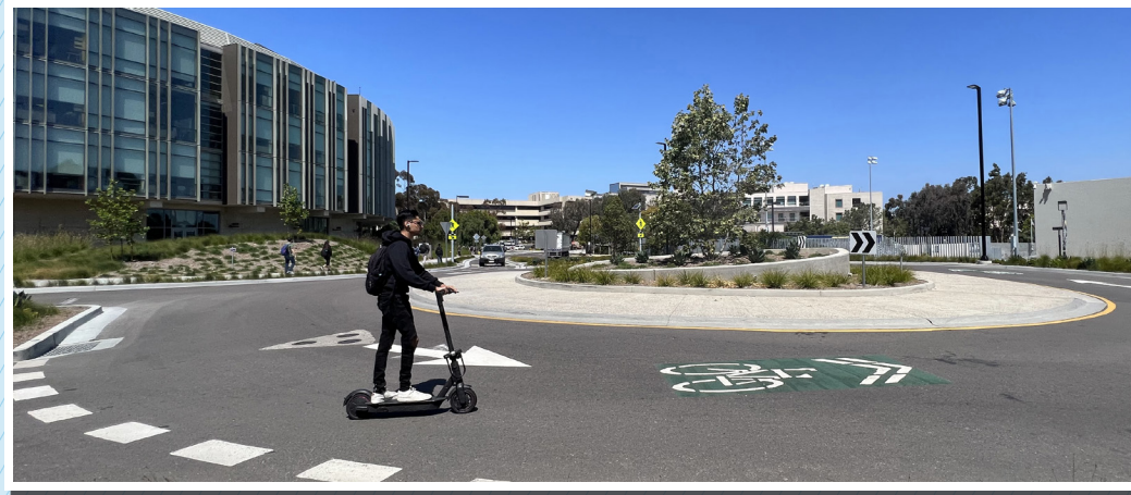
Roundabout and sharrows

Objective 7.4 During the planning phase for mobility projects, document that they will be resilient to the impacts of climate change and create and/or maintain mobility network redundancy that ensures evacuation routes during emergencies are sufficient for all types of users and provide alternative options in case one becomes unusable.