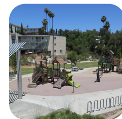
Promote Cohesive New Development

The Chollas Creek Master Plan will be a long-term planning document developed by the City of San Diego in partnership with various stakeholders and community members to guide the sustainable future of the Chollas Creek Watershed as a regional park. The goals of the Master Plan are to protect and enhance Chollas Creek Watershed's ecology; improve the watershed's sustainability and resilience to the impacts of climate change; increase recreational opportunities; improve walking/rolling and biking within the watershed and adjacent neighborhoods; and foster a sense of ownership and connection to the Creek among community members.