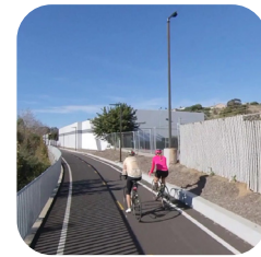
Reduce Greenhouse Gas Emissions