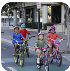
Improve Public Health