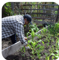
Expand Economic Opportunity