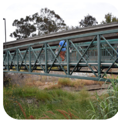
Increase Pedestrian Opportunity