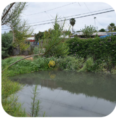
Restore Ecological Habitats