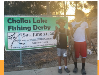
Fishing Derby at Chollas Lake Park