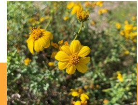
San Diego Sun Flower ( Bahiopsis laciniata )