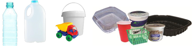
Rigid Plastics Including Bottles, Jars, Clean Food Waste Containers, Jugs, Tubs, Trays, Pots, Buckets and Toys