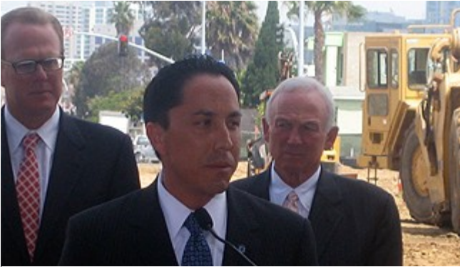
Councilmember Gloria speaks about the future of redevelopment in San Diego.