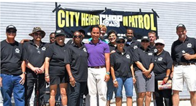
The first anniversary of City Heights on Patrol was celebrated in July.