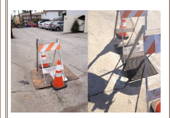
A replaced street grate in an alley in the 3900 block of Alabama Street