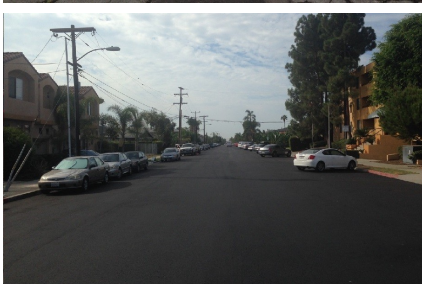
Illinois Street before and after

• Several streets in North Park were repaved in August, including Granada between Myrtle and University, Van Buren between Cleveland and Campus, Landis between Arizona and Villa Terrace and between Pershing and Ray, Illinois between University and Howard, Kansas between University and Polk, Ohio between University and Howard, Polk between 30th and Iowa, Capps between 28th and Ray, Dwight between Granada and 30th, and Gunn between Utah and Ray.