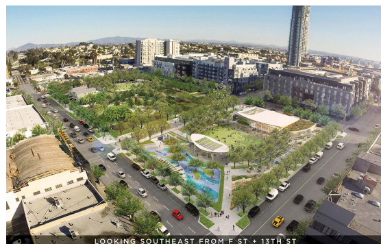
Rendering of East Village Green

"While this is not the final step, the Council's action brings these important community projects closer to reality," said Councilmember Todd Gloria.