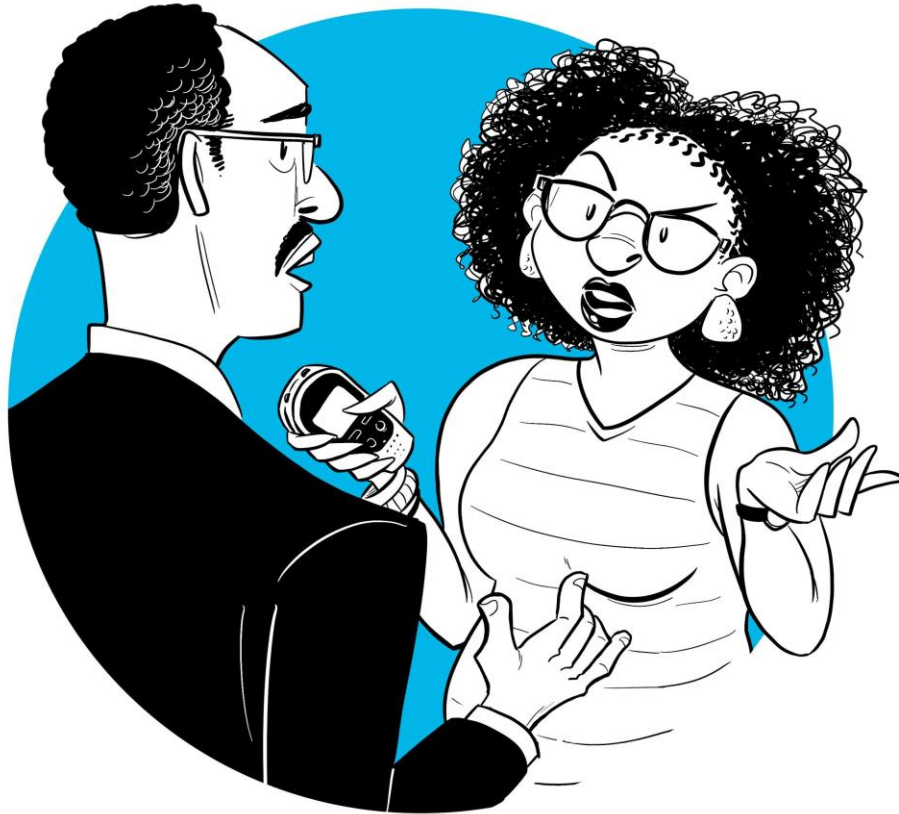
Feiht Aton Digs for Clues (Otnay an Uspectsay)

“Feiht, please do me a favor and take one last look around the library and see if perhaps there are any more clues, or if perchance, you see Golatac!” “Got it Llati!” he replied eagerly. “Just tell me where to look!”