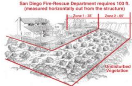
After Thinning and Pruning

Santa Ana winds have returned to San Diego County, creating potentially dangerous, wind-driven wildfires. Over the next several months, a uniformed Code Compliance Officer from the San Diego Fire-Rescue Department's Brush Management Program will be performing door-to-door brush inspections in District Five.