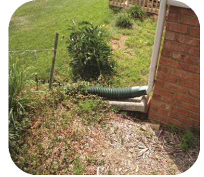
Figure 1-5. Downspout extension