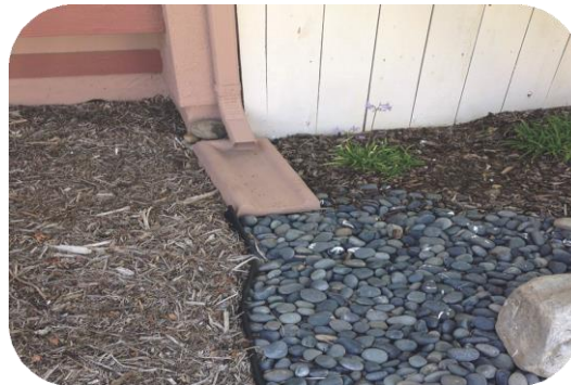
Figure 1-4. Splash block and riprap