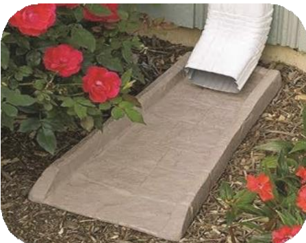
Figure 1-3. Typical splash block

Splash blocks and/or riprap rock areas are encouraged because they adequately dissipate redirected flows and prevent erosion (see Figures 1-3 and 1-4). Splash blocks are comprised of either concrete or plastic and are available at most home improvement stores. Riprap rock areas should include gravel, river stones, or rock swales embedded in the soil to a depth of at least 2 inches. The downspout should be angled away from the structure foundation at the redirect location (see Figure 1-5). If the area immediately adjacent to the downspout is too flat or prone to ponding, downspouts can be lengthened to an area better suited for water flows and infiltration.