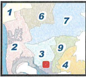
DESIGN LOCATION MAP