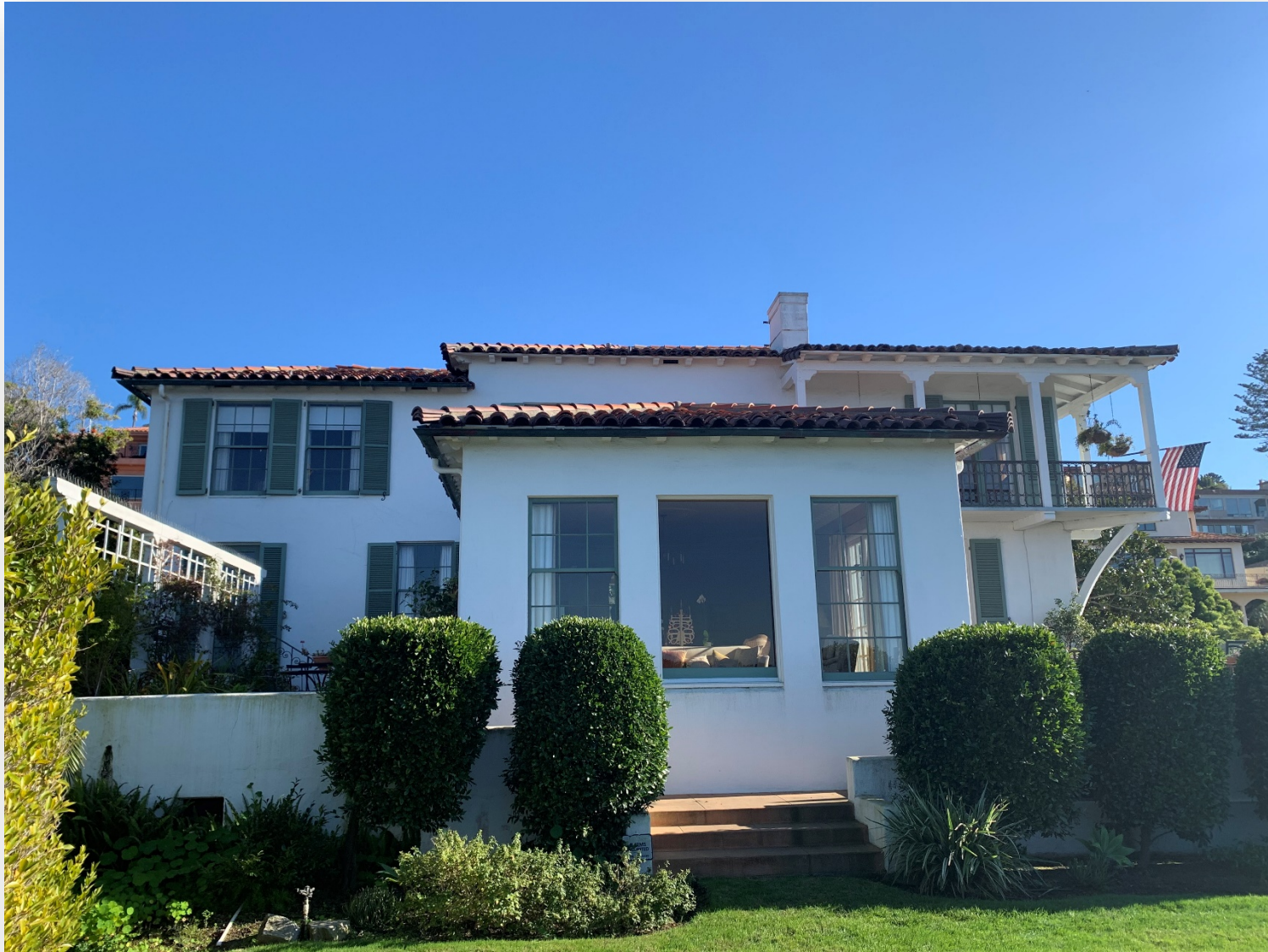
Northwest (rear) elevation