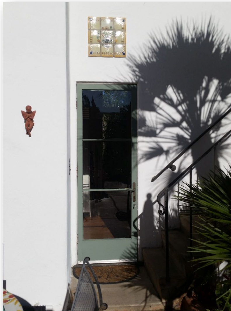
Replacement door onto courtyard (southwest elevation)