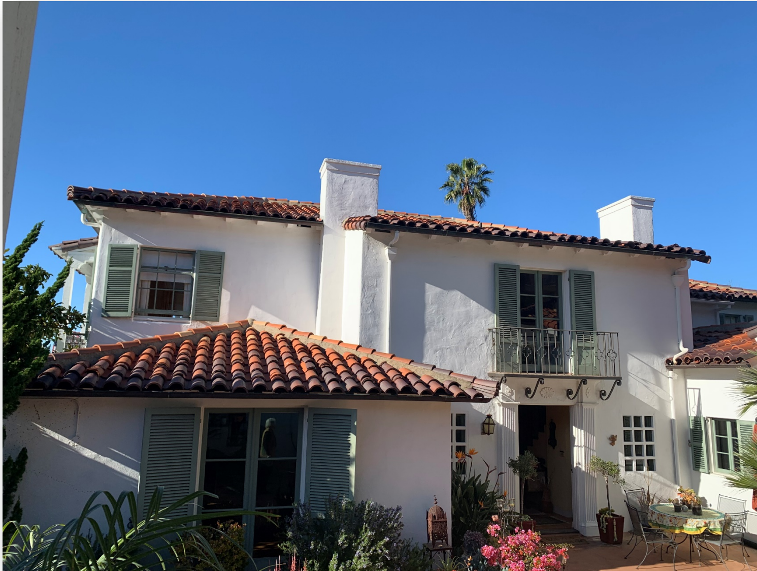
Southeast (front façade) elevation