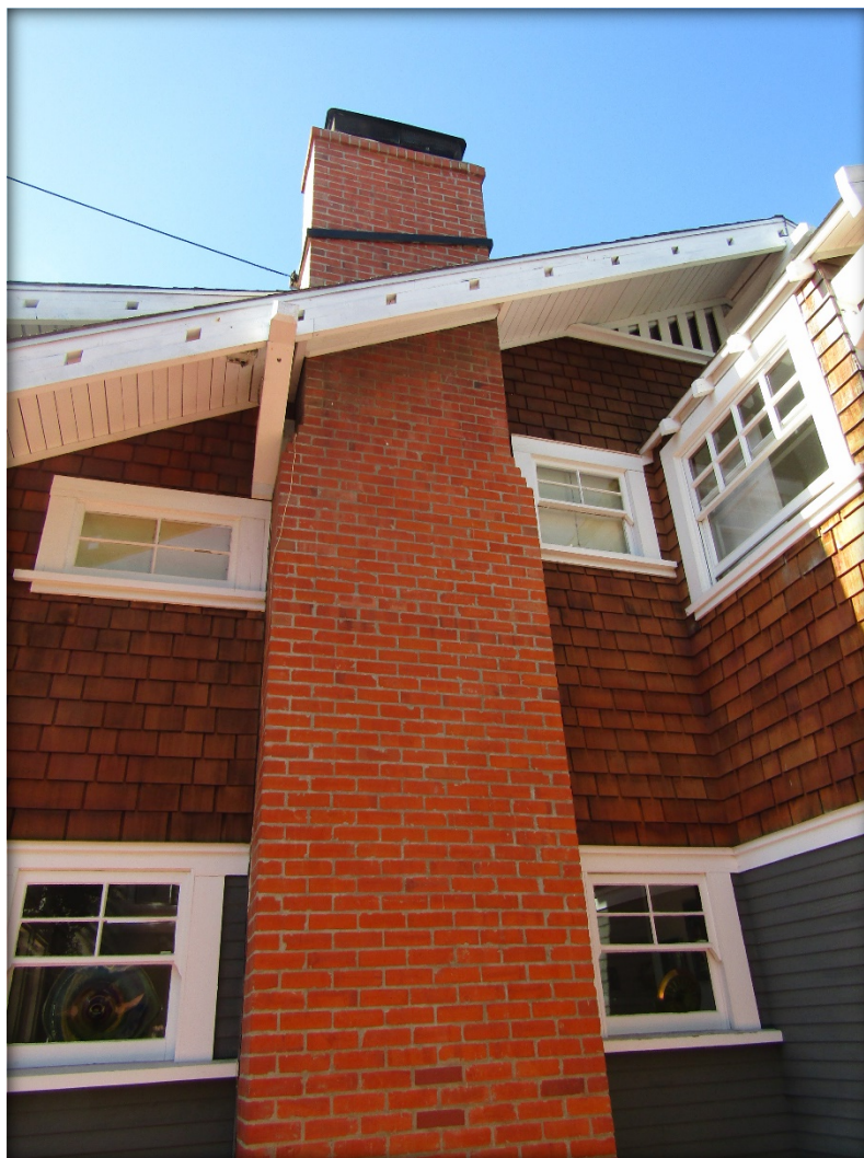
East Elevation Detail