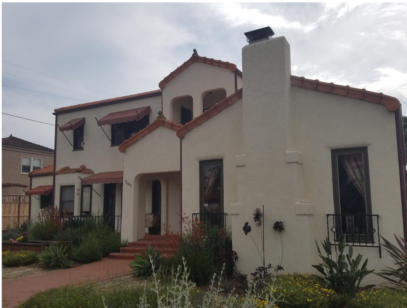
East (façade) elevation June 2020