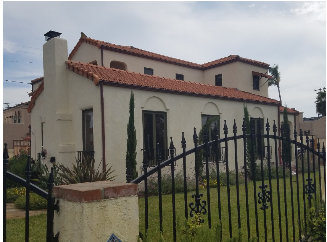
Northeast (façade) elevation June 2020