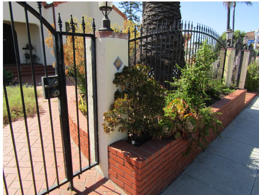
Brick fence along the East (façade) elevation August 2019