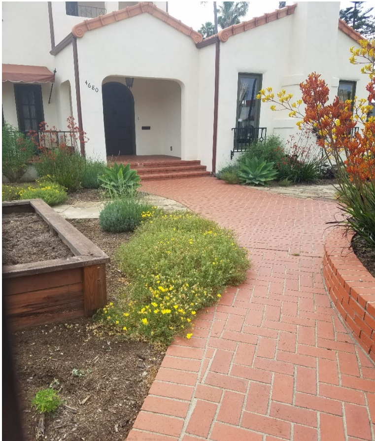
Brick walk way on the East (façade) elevation June 2020