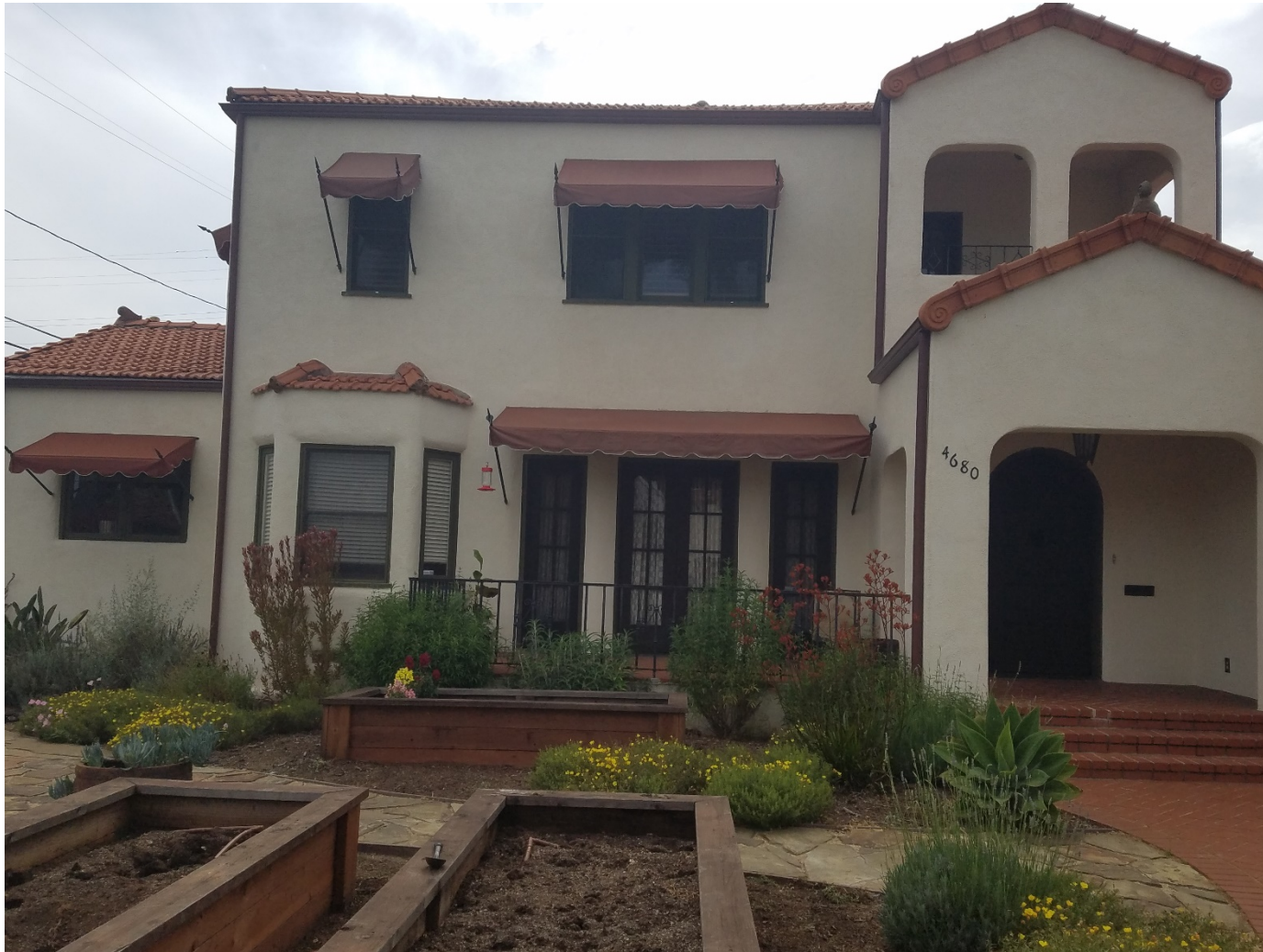
Front entry June 2020