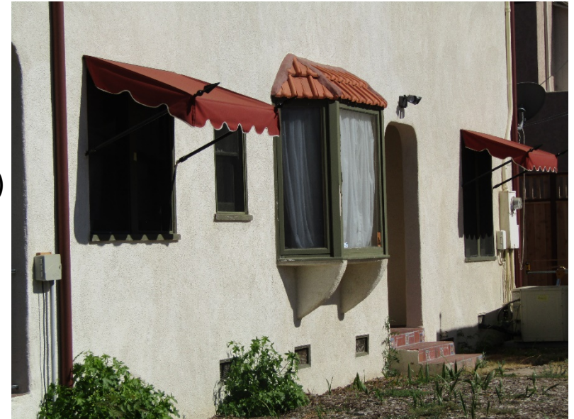
West (façade) elevation's bay window August 2019