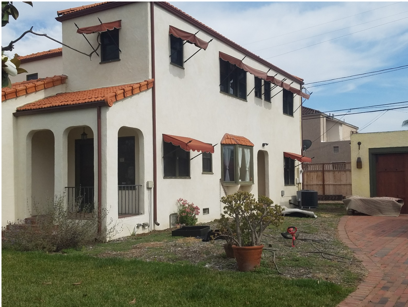
Northwest (façade) elevation June 2020