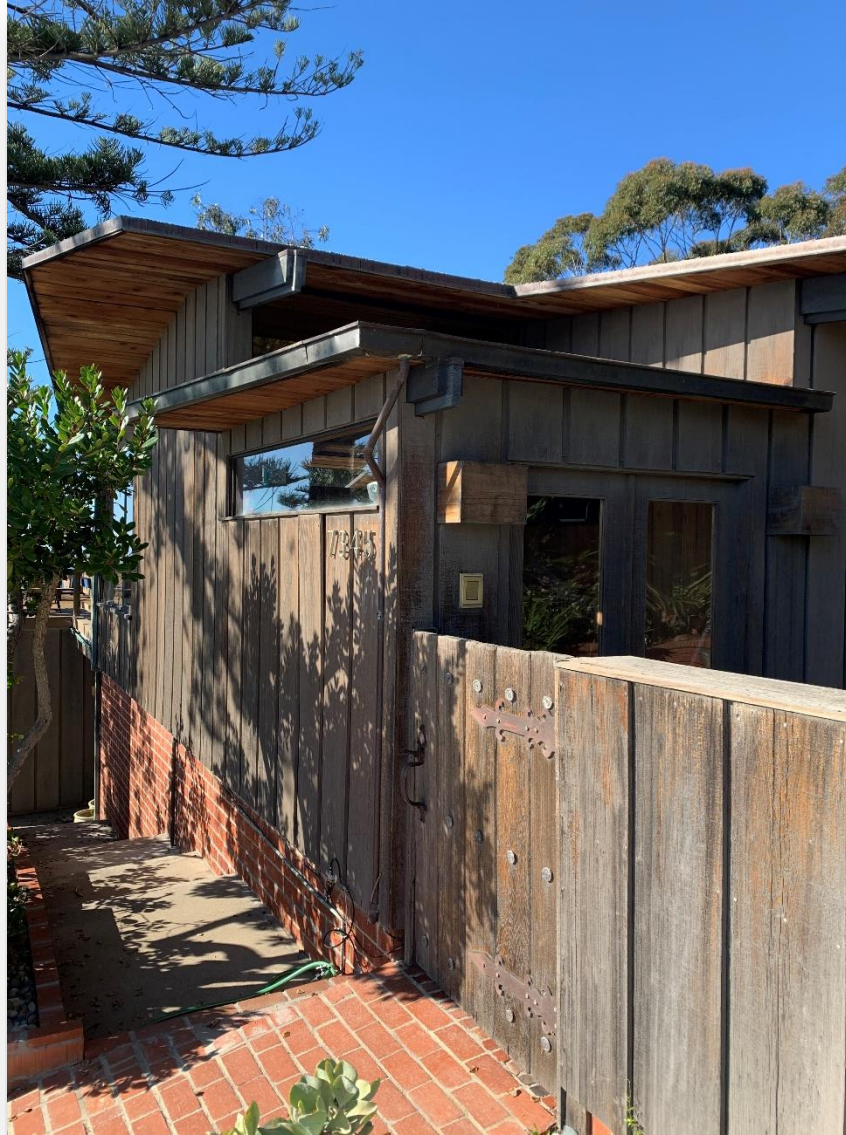
Southwest and southeast elevations