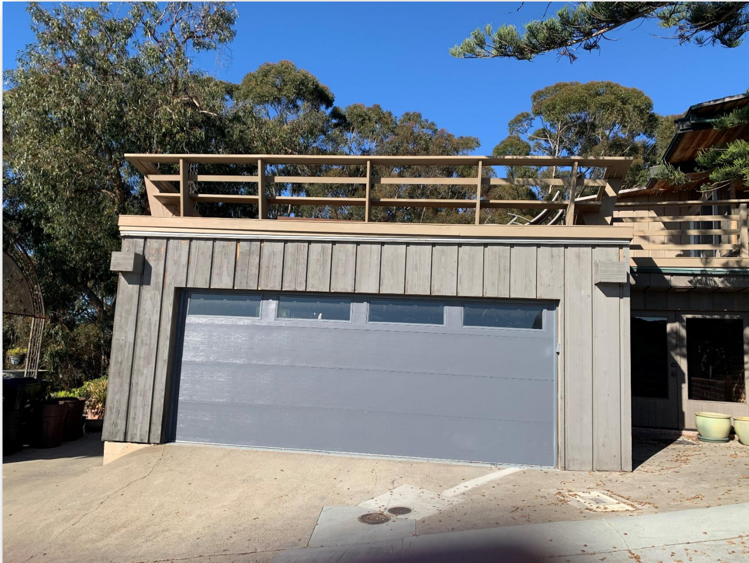
Southwest elevation of addition