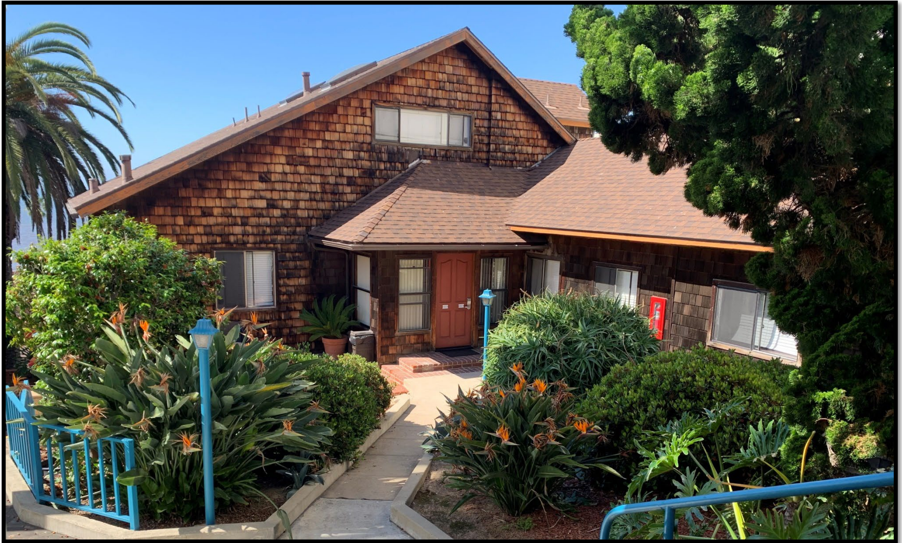
Street Facing Elevation