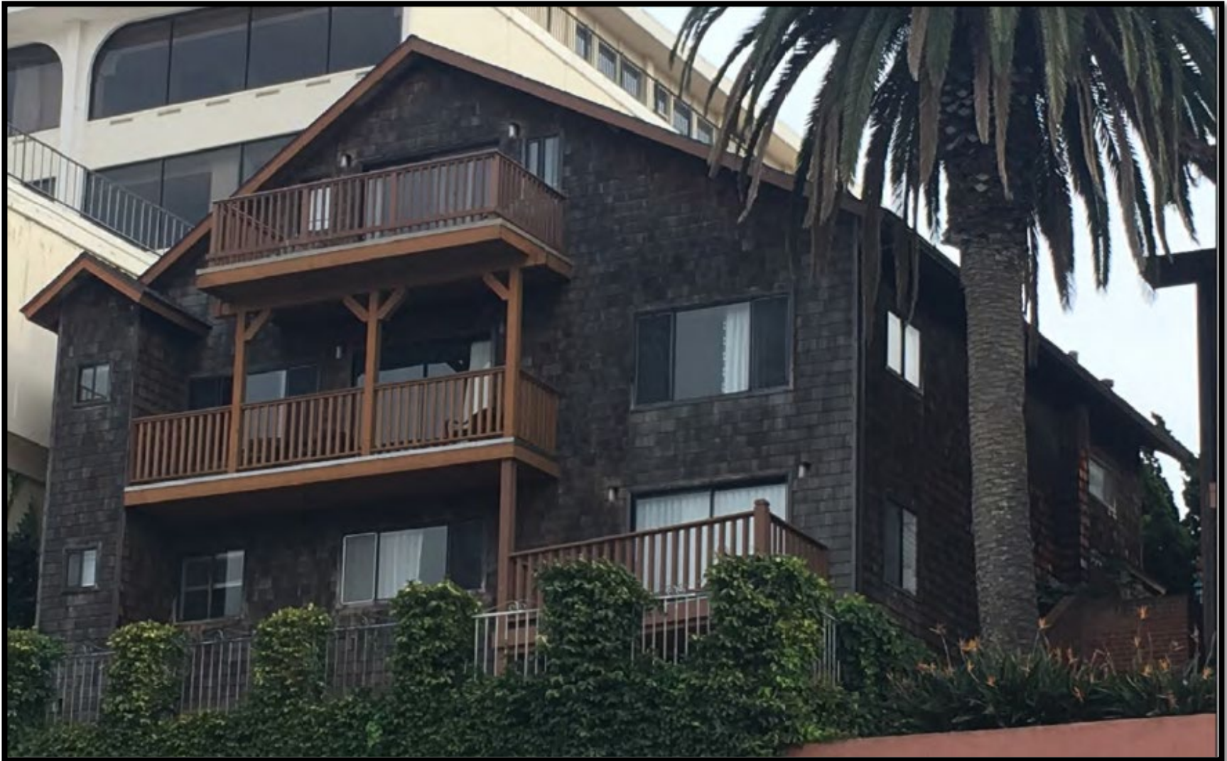
Rear Elevation