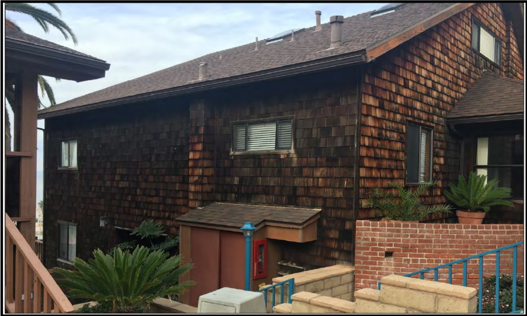
Side Elevation