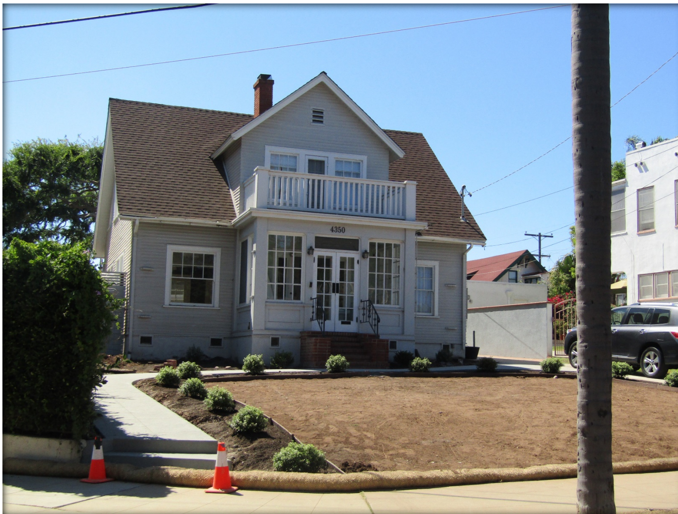
East Façade, 2019