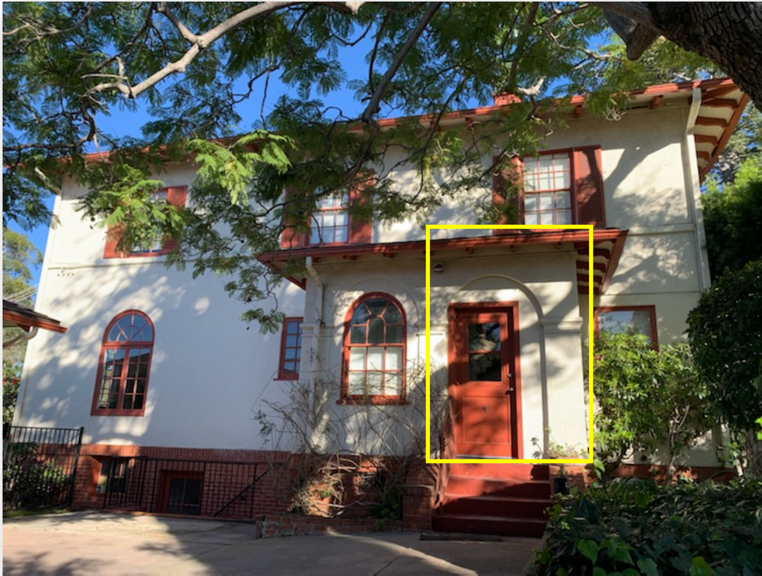
West elevation with enclosed porch