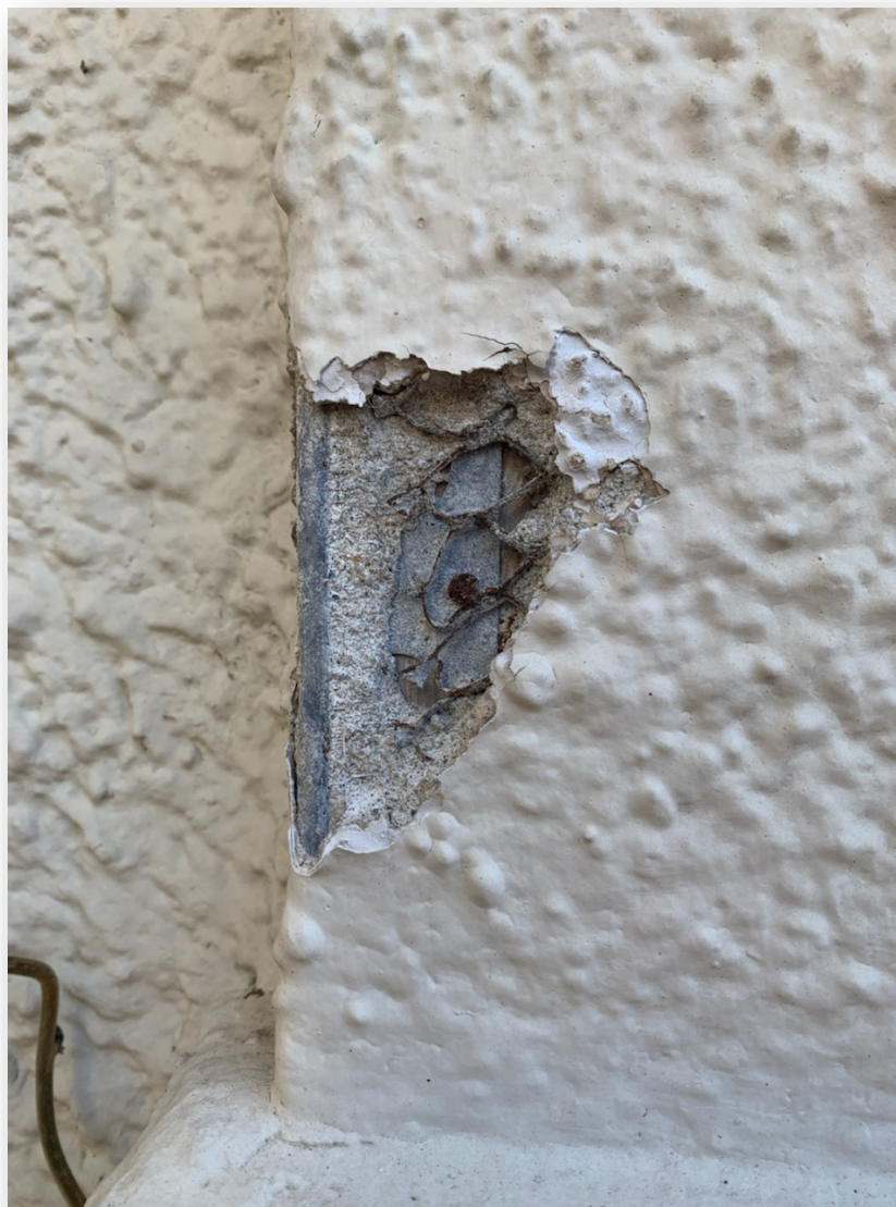
Wire mesh behind current stucco