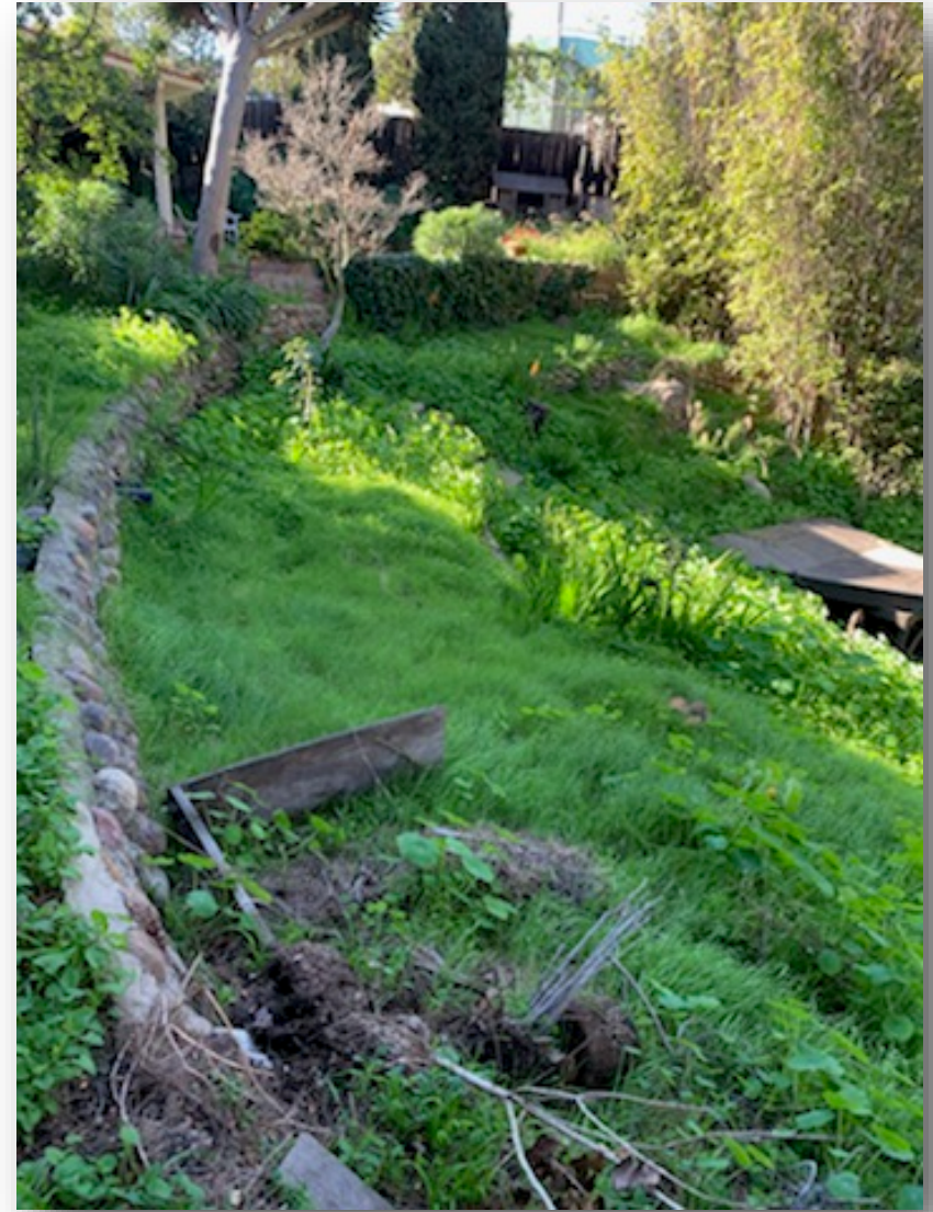
Portions of cobblestone wall