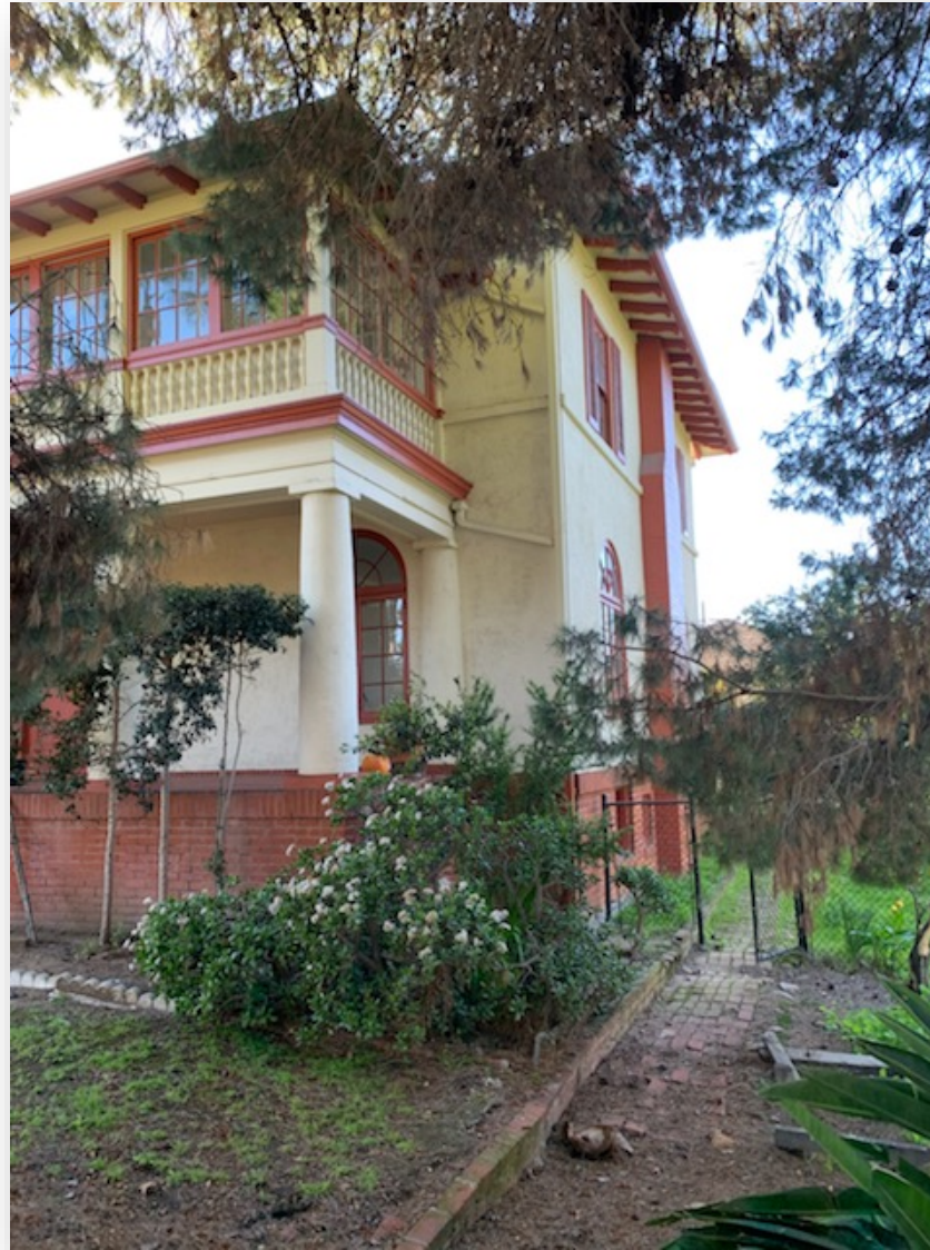
East and north elevations