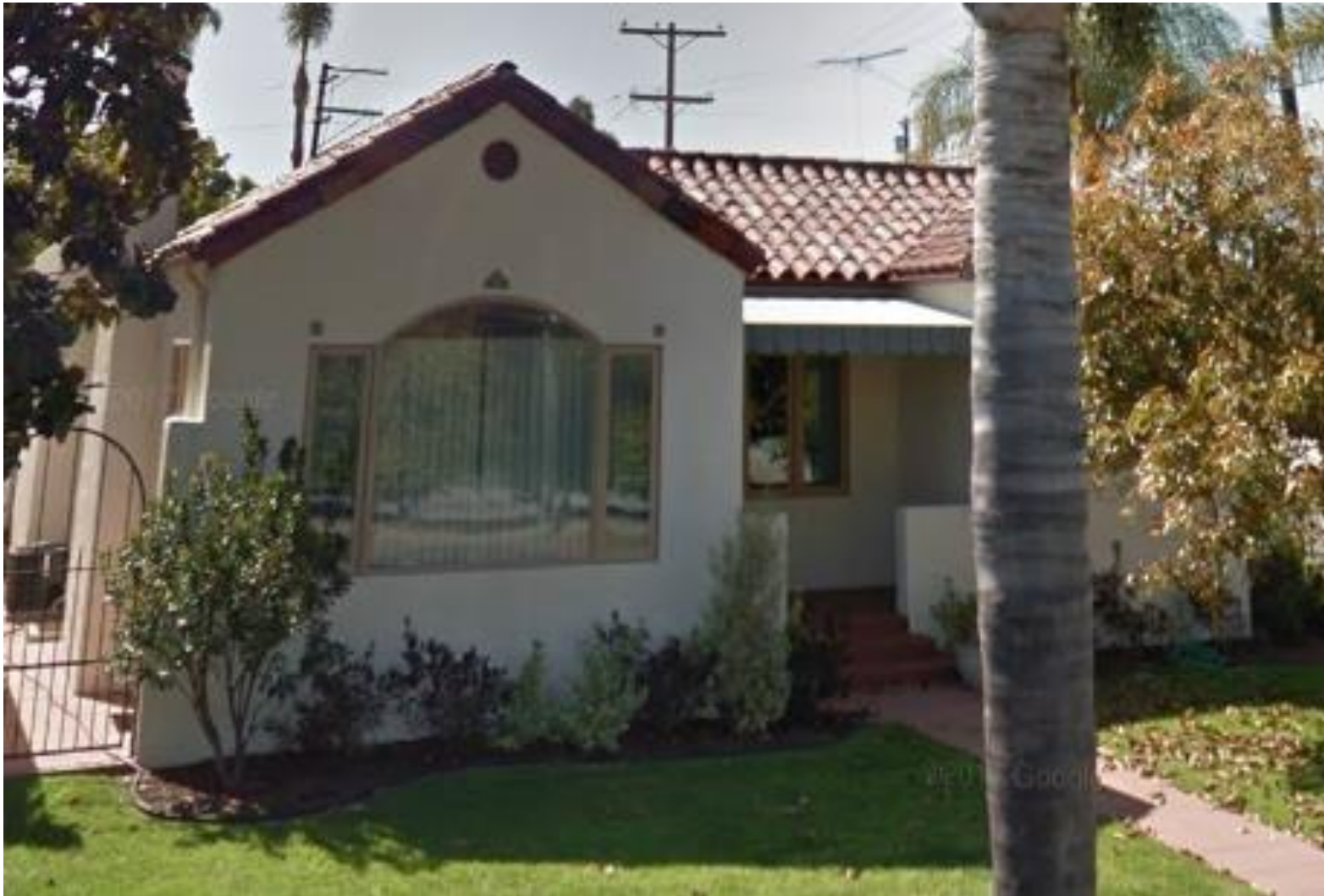
East Elevation, April 2017