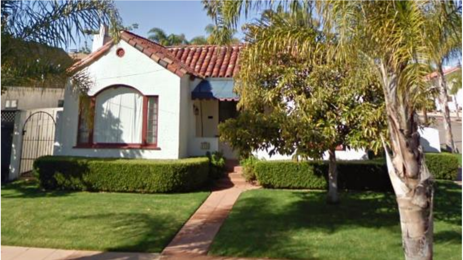
East Elevation, February 2009