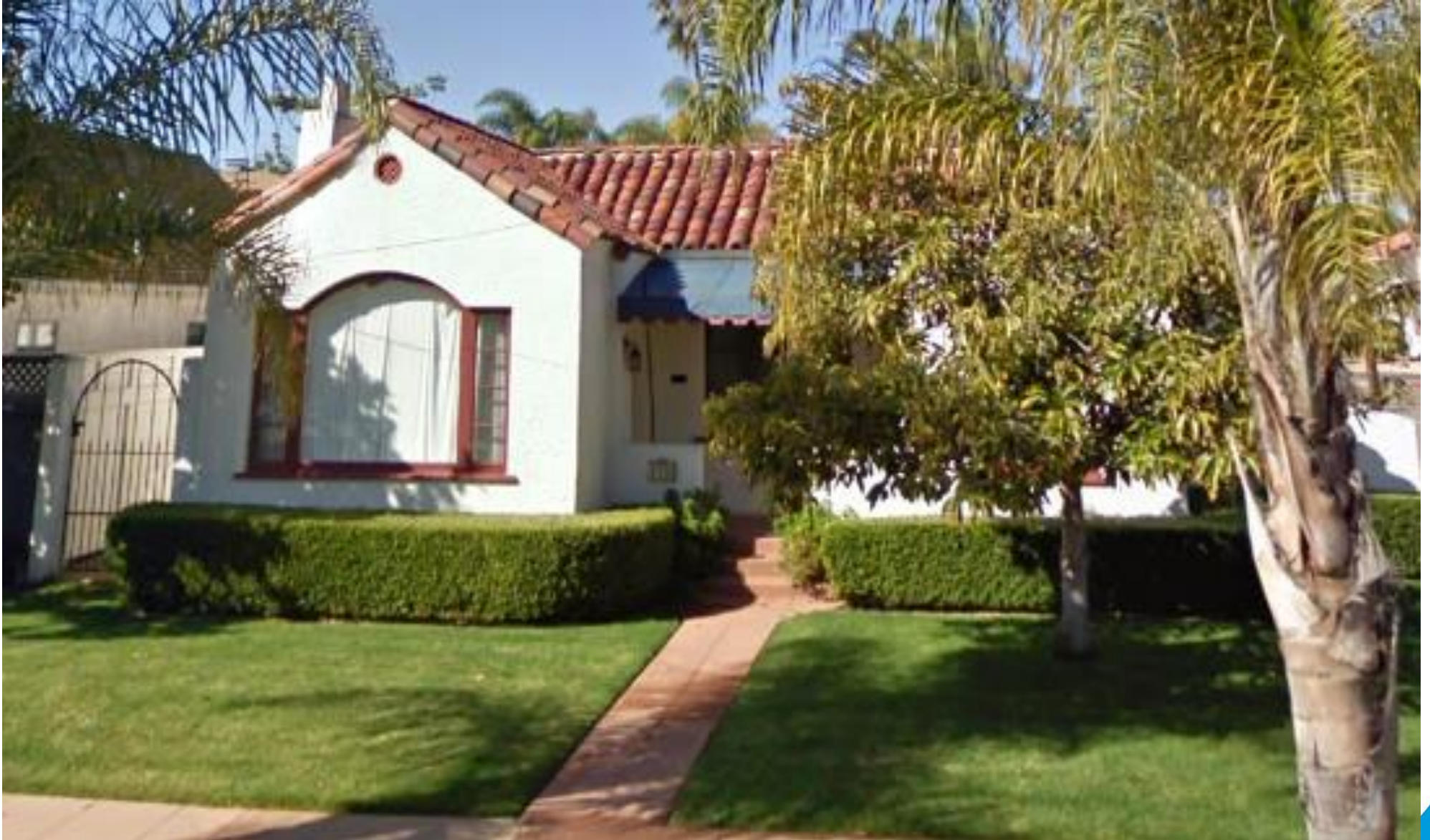
East Elevation, February 2009