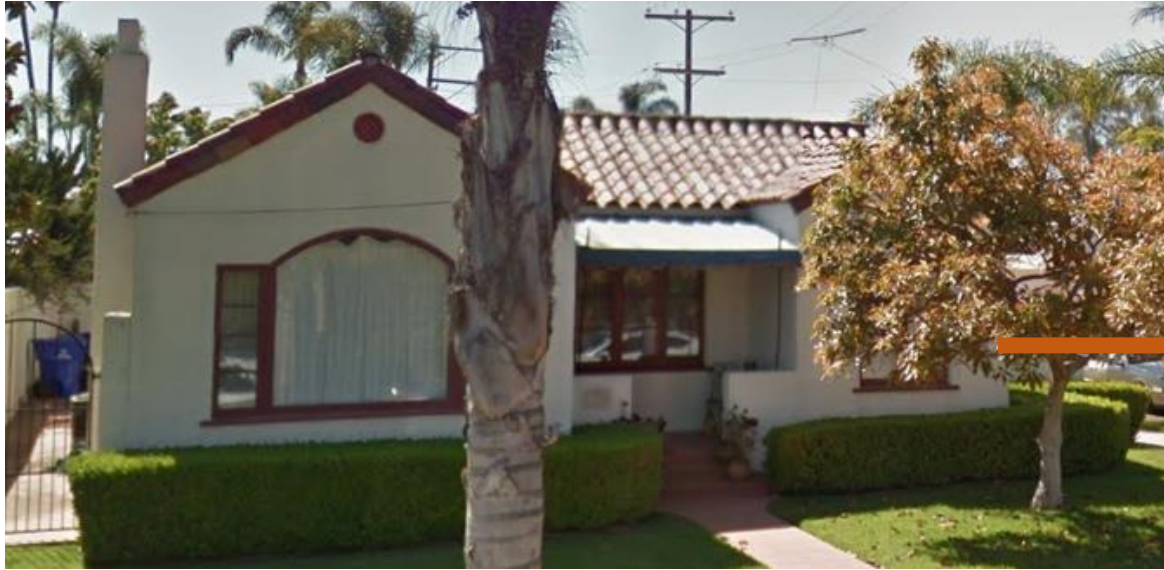
East Elevation, April 2011