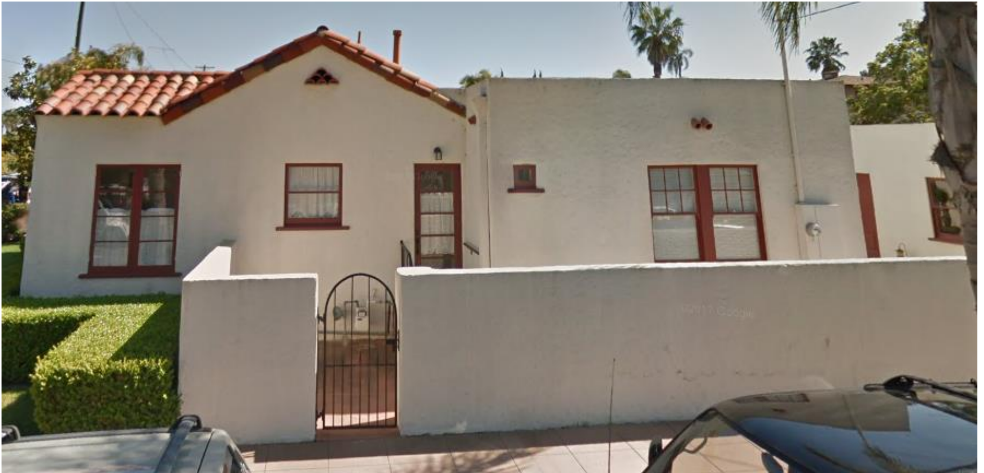
North Elevation, April 2011