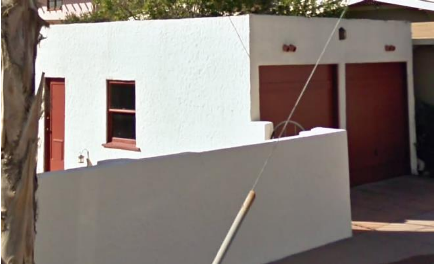
North Elevation, February 2009