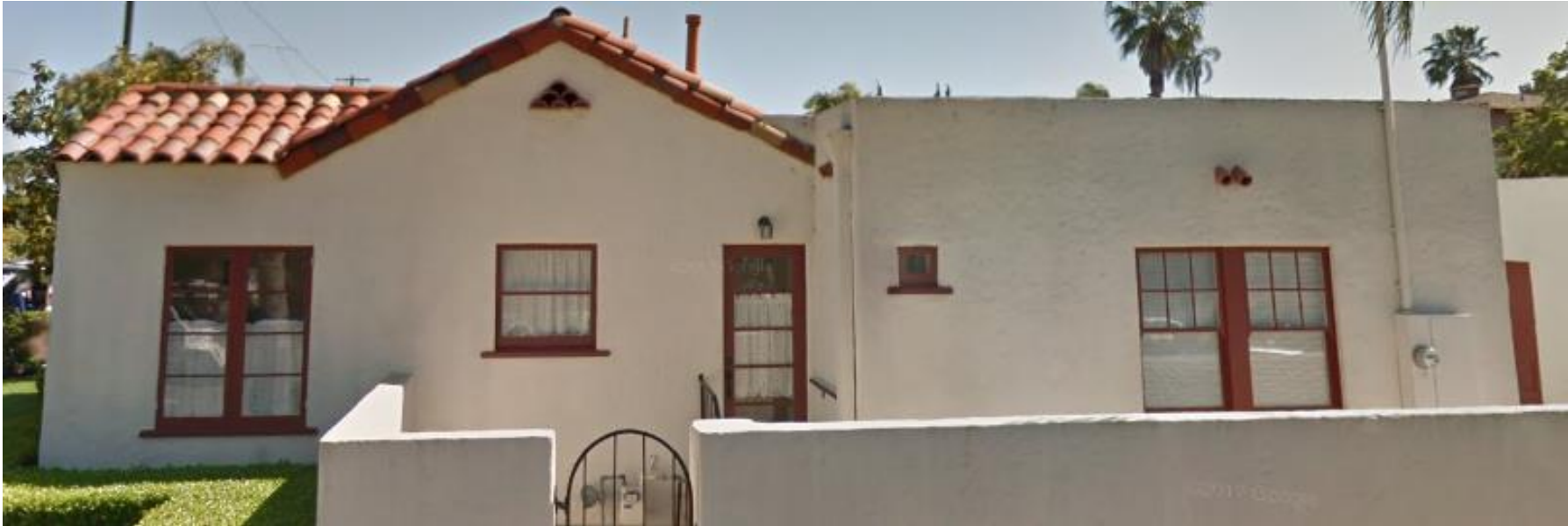
North Elevation, April 2011