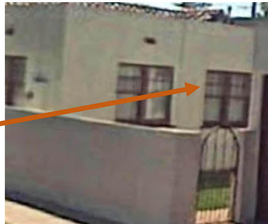
North & West Elevation, August 2007