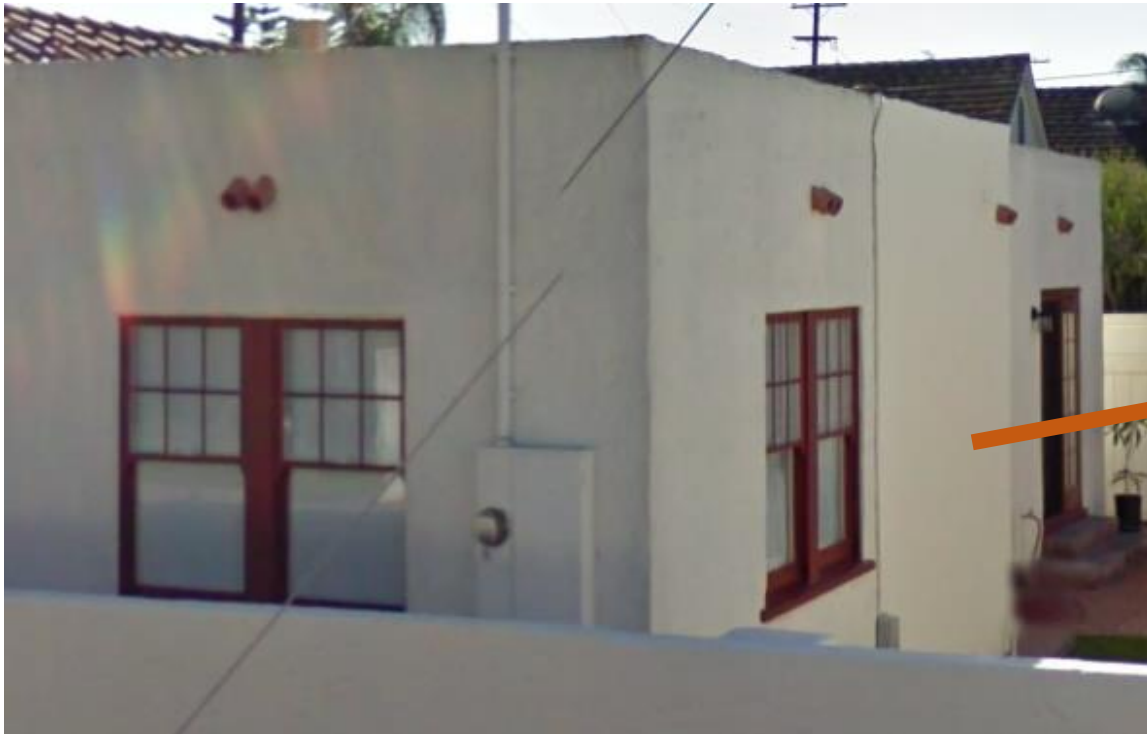
North & West Elevation, February 2009