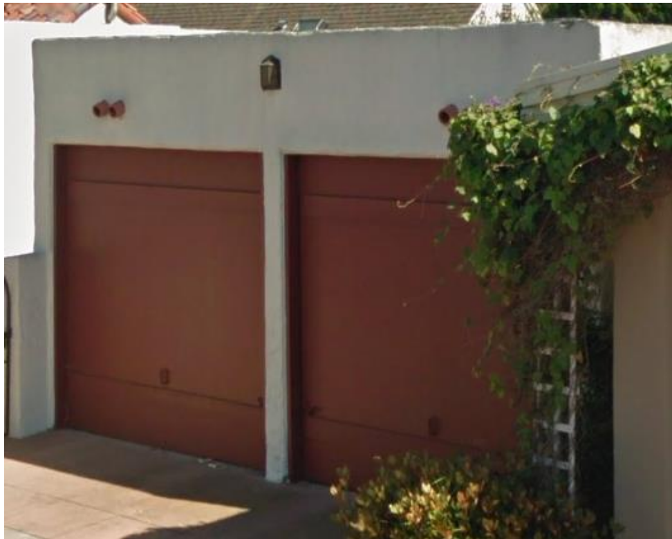
North Elevation, April 2011