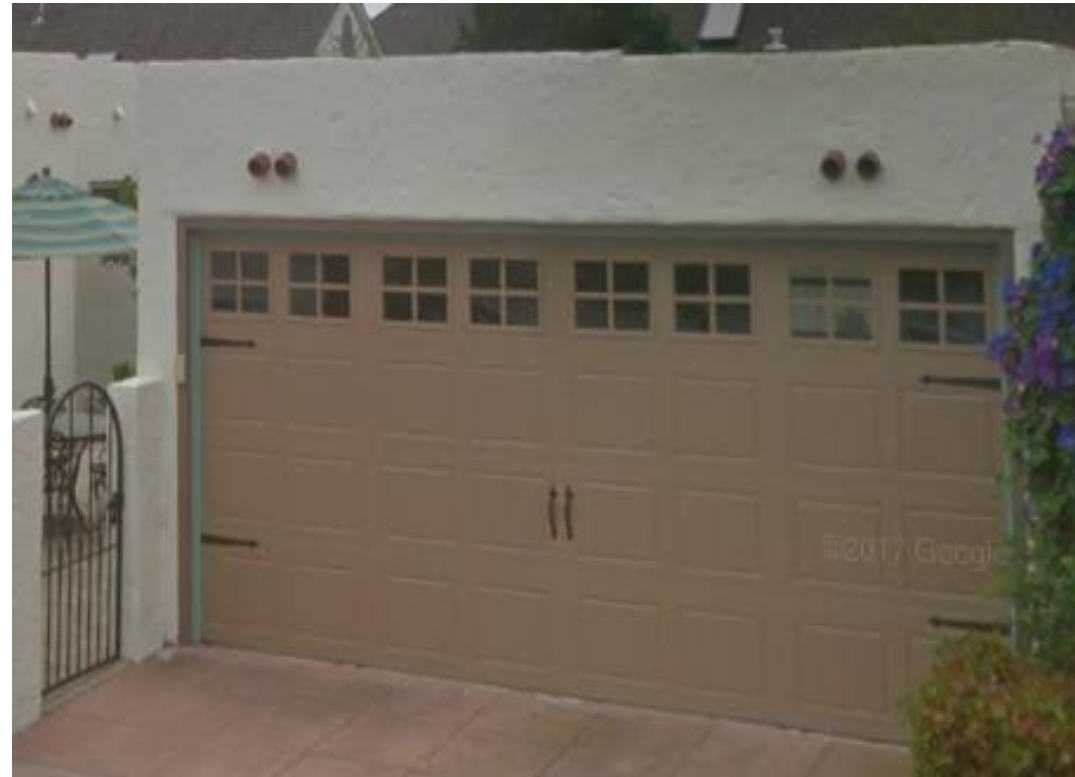
North Elevation, May 2016