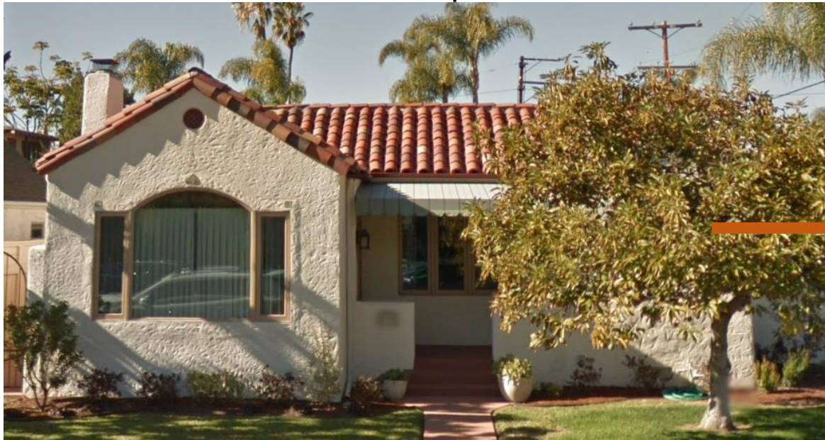
East Elevation, December 2015