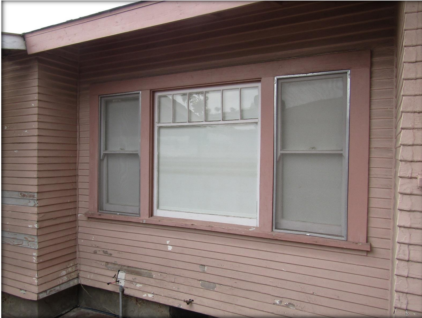
South Façade Window detail